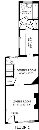
FLOOR 1 GROSS INTERNAL AREA: FLOOR 1 379 sq.ft. FLOOR 2 258 sq.ft. TOTAL: 637 sq.ft.