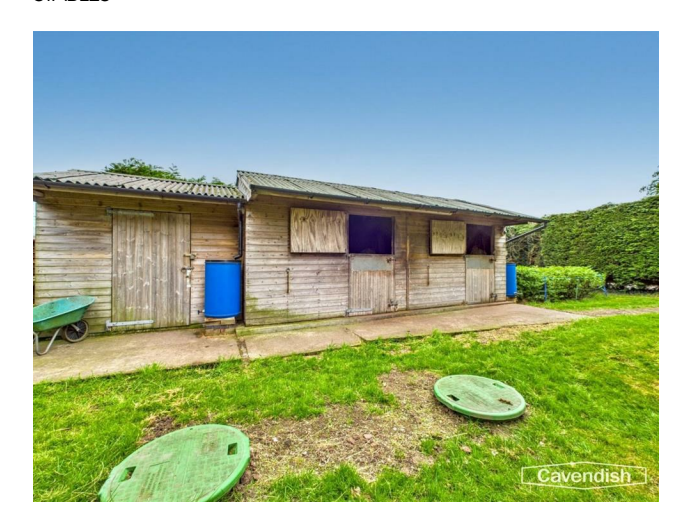
The stables are erected on shared land with permission from the Management Company at no cost.

There is a flood lit all weather outdoor arena. STABLES