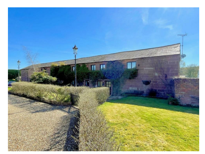
To the front there are two lawned areas enclosed by established hedging and brick walling with a gated pathway, steps to the front door, and patio area. Exterior lighting, and period cast-iron style lamp.