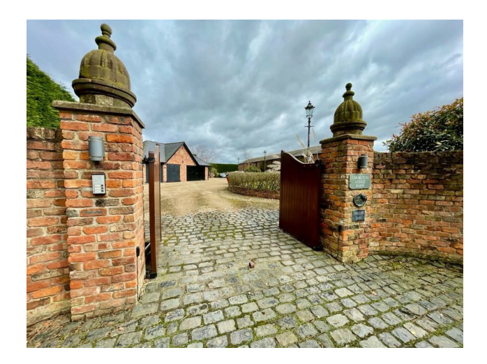
The property forms part of a small courtyard style development located along Little Rake Lane. which is approached via electronic remote controlled double opening gates.