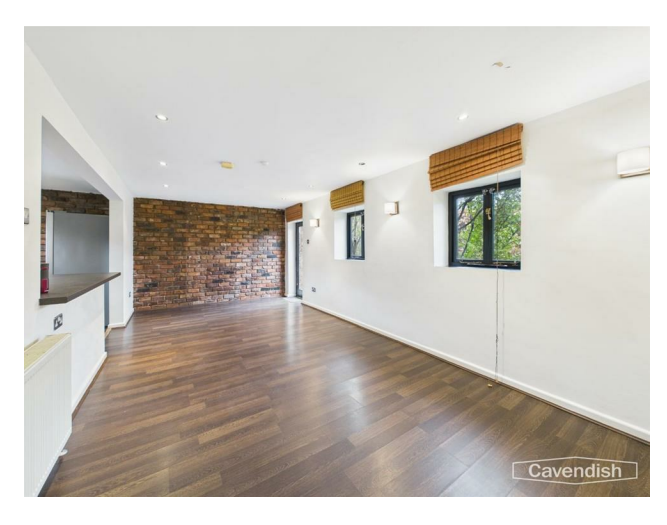
Feature exposed brick wall, recessed ceiling spotlights, laminate wood strip flooring, double radiator with thermostat, three wall light points, TV aerial point, two sealed unit double glazed windows to the rear, and glazed French door to outside. Opening to the kitchen.