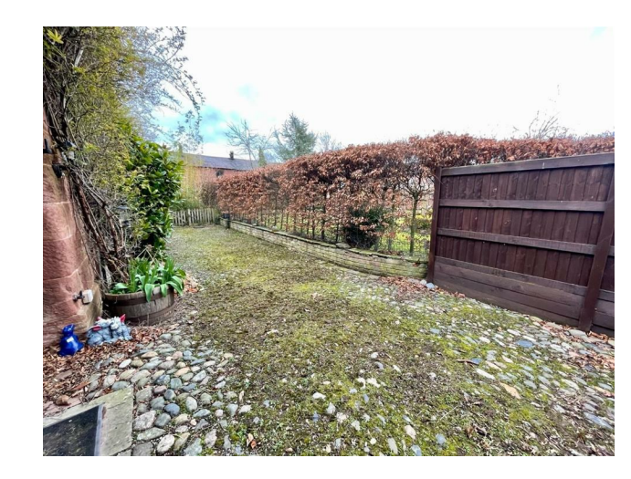
To the rear there is a cobbled courtyard style garden enjoying French doors from the living room and a French door from the dining room with mature shrubs and trees, and the original stone steps. Two outside lantern style lights.