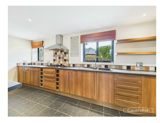
Fitted with a range of units incorporating drawers, cupboards, a pull-out larder unit and wine rack with laminated worktops. Inset one and half bowl composite sink unit and drainer with chrome mixer tap. Fitted five-ring gas (LPG) hob with tiled splashback and extractor above, built-in Neff electric fan assisted oven and grill, Neff microwave, and integrated Neff dishwasher. Slate effect flooring, feature exposed brick wall, recessed ceiling spotlights, contemporary tall tubular style radiator, and two sealed unit double glazed windows overlooking the front