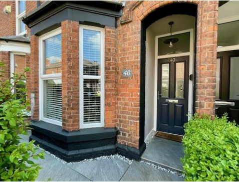
Composite door leading to Hallway.

The property is ideally situated for the amenities of Chester City Centre and the Greyhound Retail Park. The city centre provides a wealth of shops, restaurants to suit every taste and leisure facilities including the Northgate Arena and Total Fitness Centre. There a Tesco, Aldi, Lidl and ASDA supermarket situated close by. The location is also convenient for daily travel to neighbouring industrial and commercial centres via the Chester inner ring road which leads to the M53 and the motorway network. There are regular train services from Chester's main station.