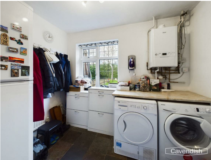
UTILITY ROOM 2.74m x 1.96m (9' x 6'5")

Fitted worktop with plumbing and space for washing machine and space for tumble dryer beneath, ceiling light point, hanging for cloaks, single radiator with thermostat, wall mounted Ideal Logic Max Combi C35 condensing gas fired central heating boiler, slate tiled floor, and UPVC double glazed leaded window overlooking the rear garden.