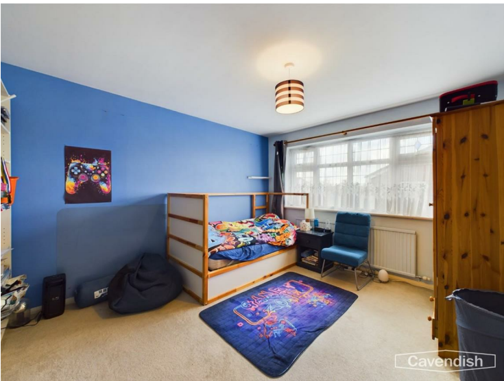
BEDROOM TWO 3.84m x 3.35m (12'7" x 11')

UPVC double glazed leaded window, ceiling light point, and single radiator with thermostat.