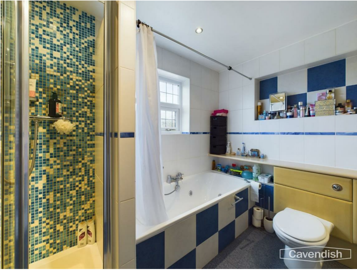
FAMILY BATHROOM 2.67m max x 2.49m max (8'9" max x 8'2" max)

Modern white suite comprising: spa bath with tiled side panel, mixer tap and shower attachment; tiled shower enclosure with wall mounted mixer shower and folding glazed door; fitted worktop with semi-inset wash hand basin, mixer tap and storage beneath; low level dual-flush WC with concealed cistern. Tiled walls with recessed tiled shelf, ladder style towel radiator, recessed ceiling spotlights, extractor, and UPVC double glazed window with obscured glass.