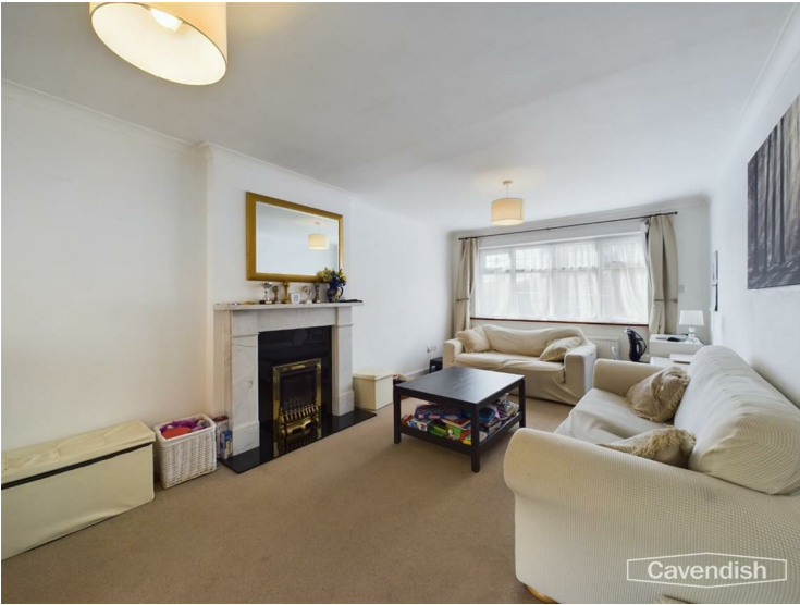
DINING ROOM 4.39m x 3.18m (14'5" x 10'5")

UPVC double glazed conservatory set on a brick-built base with double opening doors and two single doors to outside, a tiled floor with electric underfloor heating, ceiling fan with light, two wall light points,