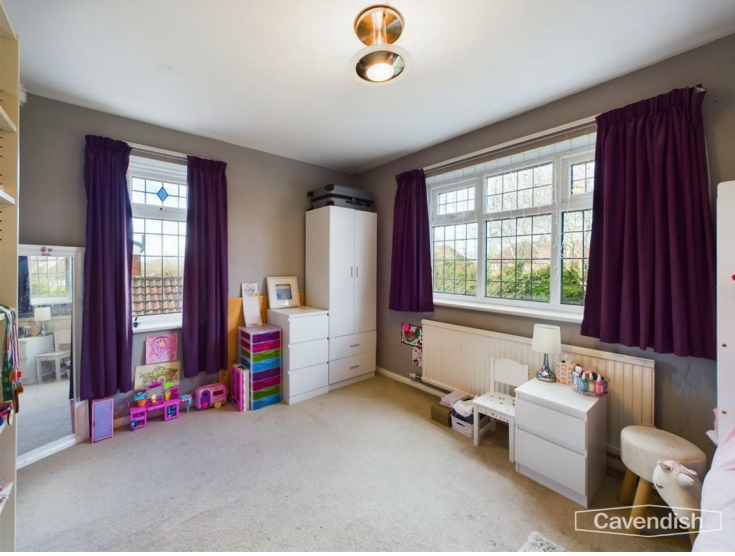
BEDROOM THREE 3.81m x 2.79m (12'6" x 9'2")

UPVC double glazed leaded windows overlooking the side and rear, ceiling light point, single radiator with thermostat, and walk-in storage cupboard with fitted shelving.