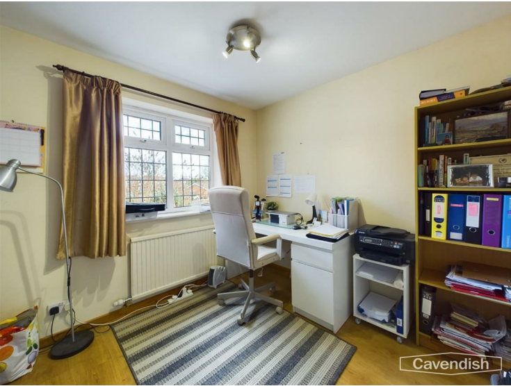
BEDROOM FOUR 3.28m max x 2.67m max (10'9" max x 8'9" max)

UPVC double glazed leaded window, ceiling light point, single radiator with thermostat, and laminate wood strip flooring.