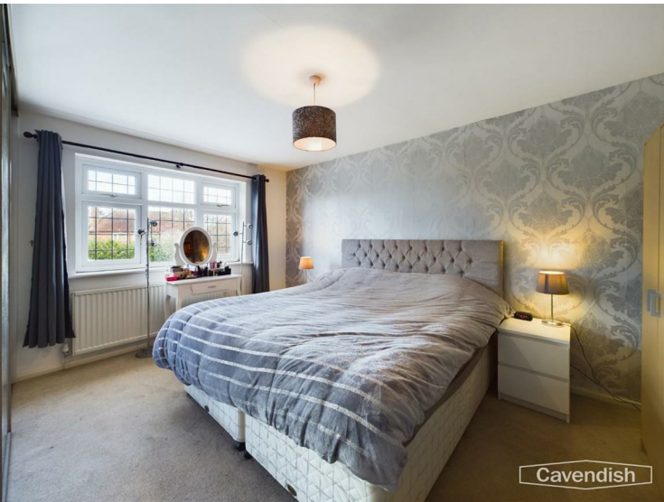
BEDROOM ONE 4.37m x 3.48m into wardrobe (14'4" x 11'5" into wardrobe)

Full height fitted wardrobes with three sliding mirrored doors having hanging space and shelving. UPVC double glazed leaded window overlooking the rear garden, ceiling light point, single radiator with thermostat.