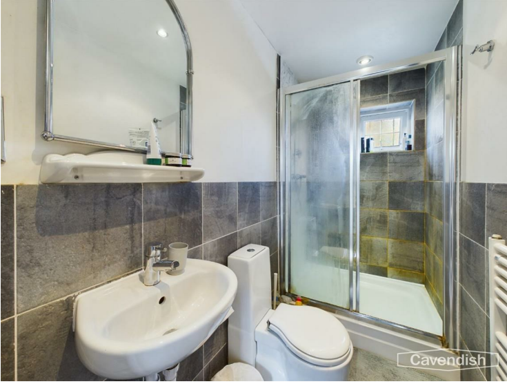
SHOWER ROOM 2.84m x 1.19m (9'4" x 3'11")

White suite comprising: shower enclosure with wall tiling and wet boarding with mixer shower, glazed shower screen and sliding glazed door; low level dual-flush WC; and wall mounted wash hand basin with mixer tap. Part-tiled walls, ladder style towel radiator, three recessed ceiling spotlights, extractor, electric shaver point, tiled floor, and UPVC double glazed window with obscured leaded glass.