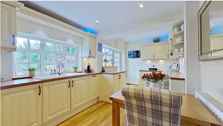
BREAKFAST KITCHEN 5.36m x 2.87m (17'7" x 9'5")

Fitted with a comprehensive range of cream fronted base and wall level units incorporating drawers and cupboards with laminated granite effect worktops. Inset one and half bowl ceramic sink unit and drainer with pelmet above and