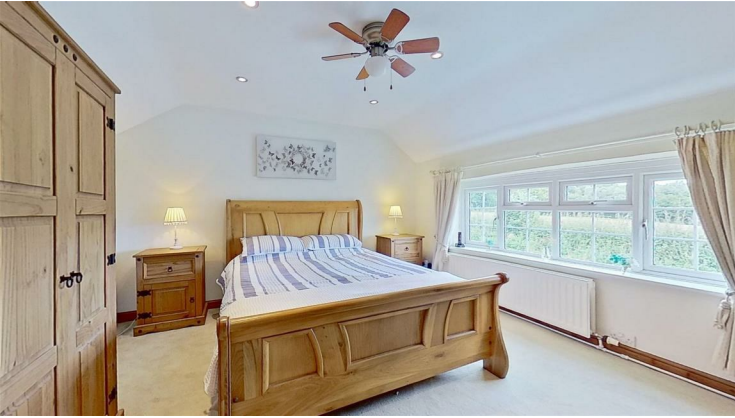
BEDROOM TWO 3.76m x 2.84m (12'4" x 9'4")

UPVC double glazed window overlooking the front, ceiling light point with dimmer switch control, recessed ceiling spotlights, access to loft space, and provision for wall mounted flat screen television.