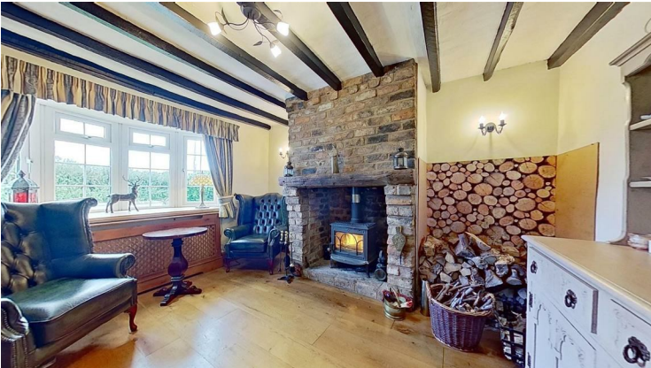
DINING ROOM 4.09m max x 3.68m (13'5" max x 12'1")

log burner, beamed ceiling with ceiling light point, two wall light points, oak wood strip flooring, radiator with radiator cover, and UPVC double glazed bay window with display windowsill overlooking the front.