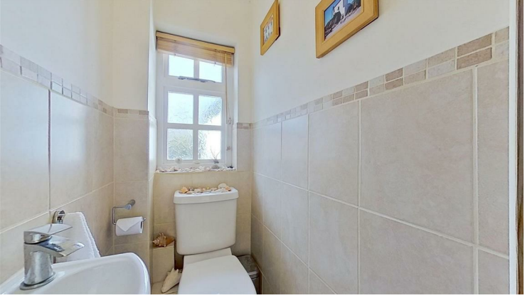
SEPARATE WC 1.37m x 0.86m (4'6" x 2'10")

White suite comprising: low level WC; and wash hand basin with mixer tap and storage cupboard beneath. Part-tiled walls, tiled floor, ceiling light point, and sealed unit double glazed window with obscured glass.