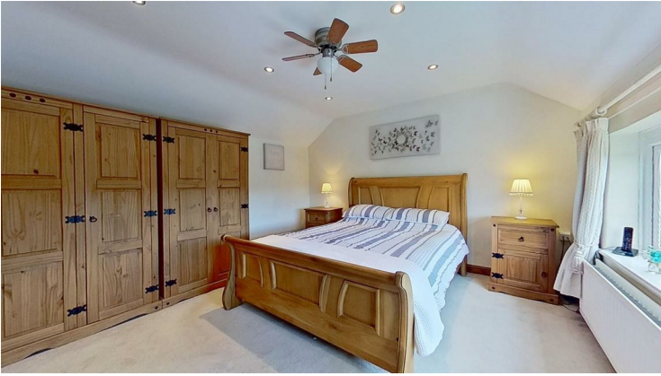
BEDROOM ONE 4.14m x 3.71m (13'7" x 12'2")

UPVC double glazed window overlooking the front, ceiling light point with dimmer switch control, recessed ceiling spotlights, access to loft space, and provision for wall mounted flat screen television.