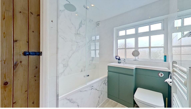
BATHROOM 2.44m x 1.85m (8' x 6'1")

Newly fitted (2024) suite in white with chrome style fittings comprising: bath with mixer tap; vanity unit with wash hand basin, mixer tap, and storage cupboard beneath; and low level WC with concealed cistern. Wet boarding to bath and shower area, tiled walls, ladder style towel radiator, vinyl wood effect strip flooring, recessed LED ceiling spotlights, illuminated wall mirror, extractor, built-in airing cupboard housing the pressurised hot water cylinder and immersion heater with slatted shelving, and UPVC double glazed window with obscured glass.