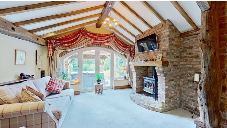
LIVING ROOM 6.35m max x 4.06m narrowing to 3.58m (20'10" max x 13'4" narrowing to 11'9")

Large split-level living room with feature part-vaulted ceiling, exposed beams and timbers, feature brick fireplace and hearth housing a cast-iron 'Living Flame' log-effect gas fire, semi-recessed ceiling spotlights, ceiling light point, two radiators with radiator covers, and UPVC double glazed French doors to outside with double glazed side windows.