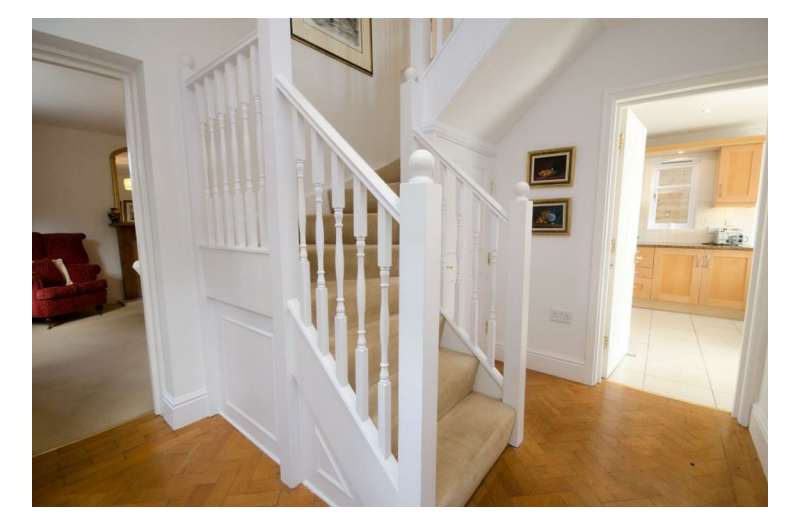
4.55m plus bay x 3.94m (14'11" plus bay x 12'11")

Wooden panelled entrance door with glazed inserts, wood block parquet flooring, double glazed window, recessed ceiling spotlights, mains connected smoke alarm, double radiator with thermostat and turned spindled staircase to the first floor with built-in under stairs storage cupboard. Doors to the Kitchen/Dining Area, Sitting Room, and Living Room.