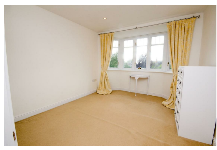
Double glazed bay window overlooking the garden and double glazed window to front, recessed ceiling spotlights and double radiator with thermostat,

4.01m into bay x 3.02m (13'2" into bay x 9'11")