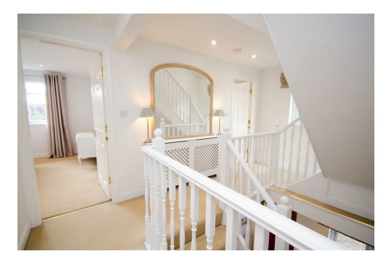
PRINCIPAL BEDROOM 4.55m into bay x 3.94m (14'11" into bay x 12'11")