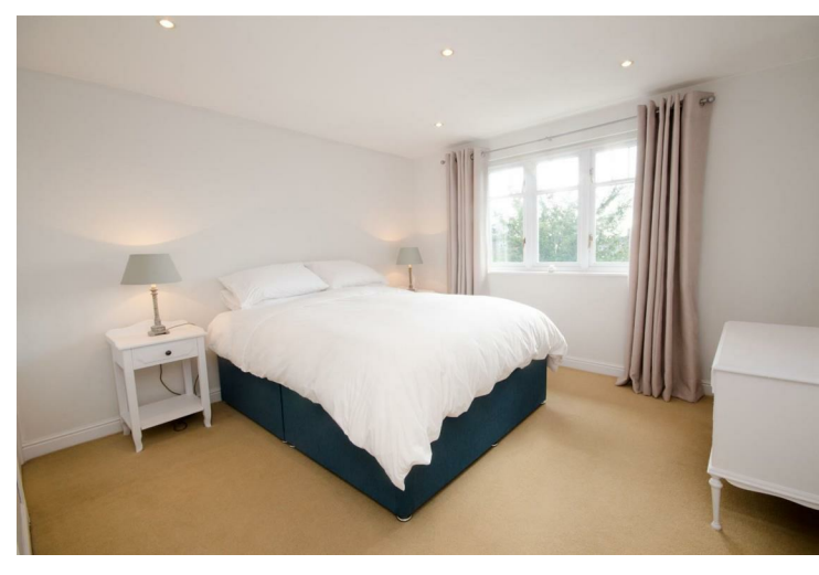
Double\ glazed\ window\ overlooking\ the\ garden,\ recessed\ ceiling\ spotlights,\ double\ radiator\ with\ thermostat,\ TV aerial point and two built-in wardrobes with hanging space and shelving.