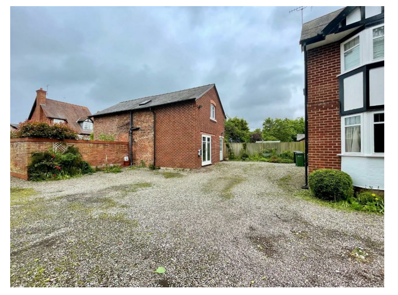
With double opening double glazed French doors. Connecting door to the Annexe.