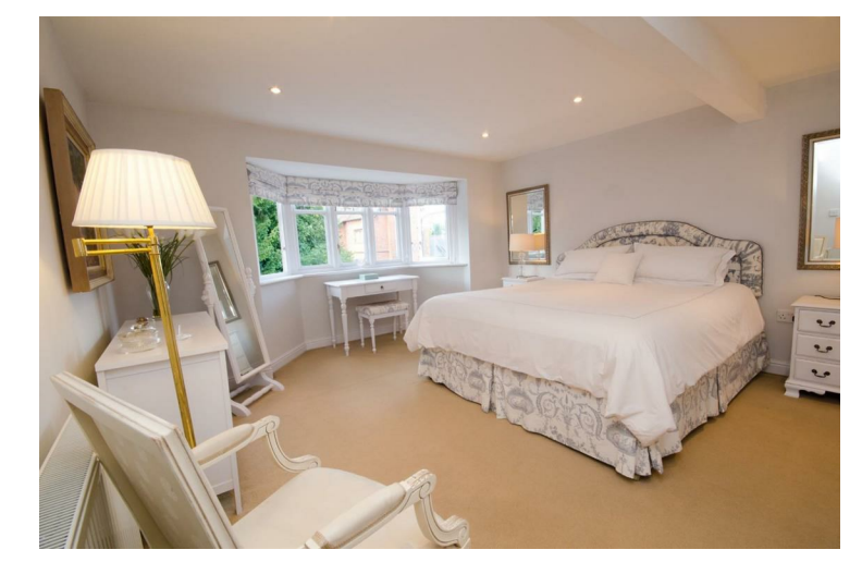
Double glazed bay window, recessed ceiling spotlights, double radiator with thermostat and TV aerial point. Doors to the En-Suite Bathroom and Walk-in Wardrobe.