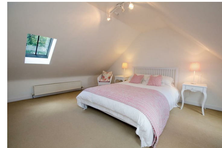
Three double glazed Velux roof lights, ceiling light point, double radiator with thermostat, built-in storage cupboard and three amp sockets with dimmer switch controls.