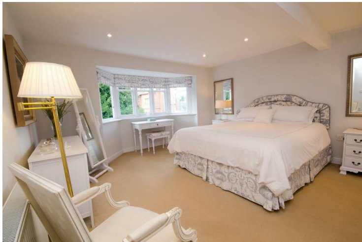
Double glazed bay window, recessed ceiling spotlights, double radiator with thermostat and TV aerial point. Doors to the En-Suite Bathroom and Walk-in Wardrobe.