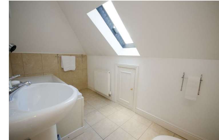
Modern white suite with chrome style fittings comprising panel bath, with mixer tap and shower attachment, pedestal wash-hand basin with mixer tap and low level dual-flush WC. Double glazed Velux roof light, double radiator with thermostat, three semi-recessed ceiling spotlights, extractor, electric shaver point, tiled floor, wall tiling to bath area, access to eaves storage area.