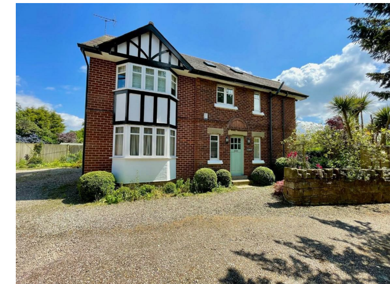
The property occupies a pleasant position in Pulford and is approached via a gravelled driveway from Dodleston Lane. To the front there is a gravelled pathway with specimen shrubs and two outside lantern-style lights. A wooden gate at the side leads to the garden. To the left there is a gravelled driveway with access to the Annex. Outside water tap. Oil storage tank. Electric car charging point.