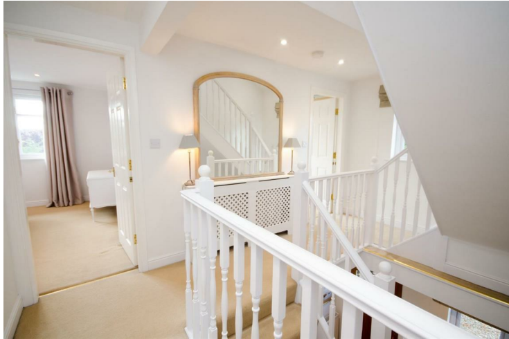
PRINCIPAL BEDROOM 4.55m into bay x 3.94m (14'11" into bay x 12'11")