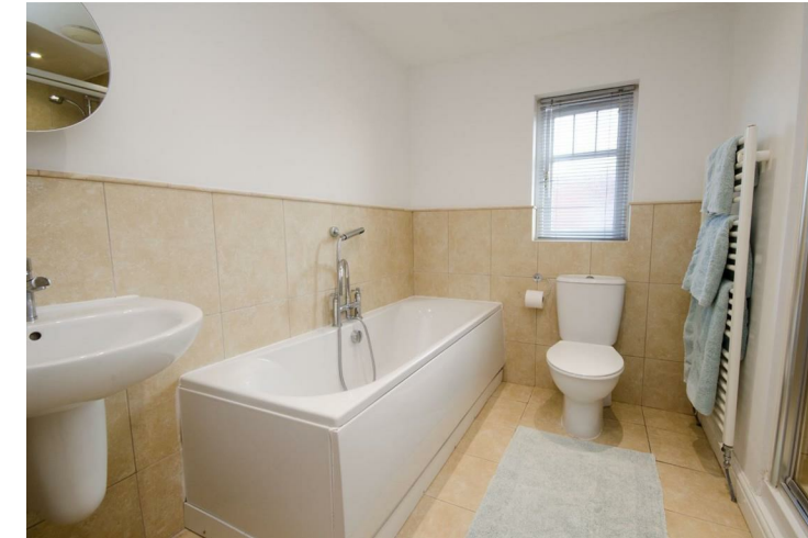
Modern white suite with chrome style fittings comprising: double-ended panel bath with central mixer tap and shower attachment; wall-hung wash-hand basin with mixer tap; low level dual-flush WC; and tiled shower enclosure with mixer shower and glazed door. Part-tiled walls, tiled floor, electric shaver point, recessed ceiling spotlights, extractor and double glazed window with obscured glass.