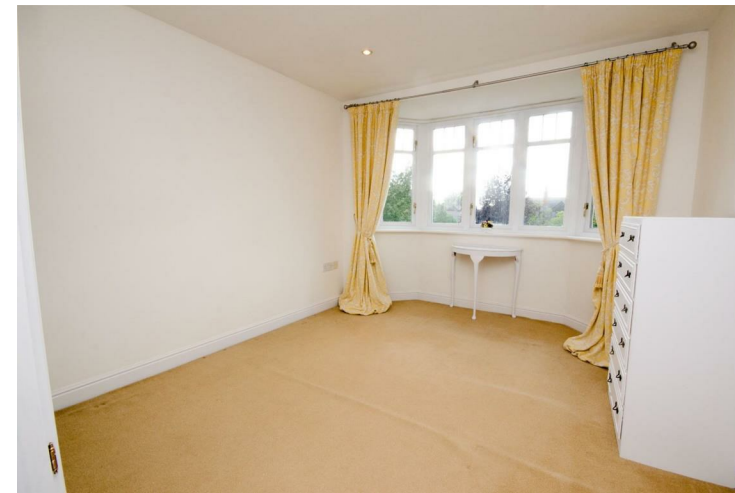
Double glazed bay window overlooking the garden and double glazed window to front, recessed ceiling spotlights and double radiator with thermostat,