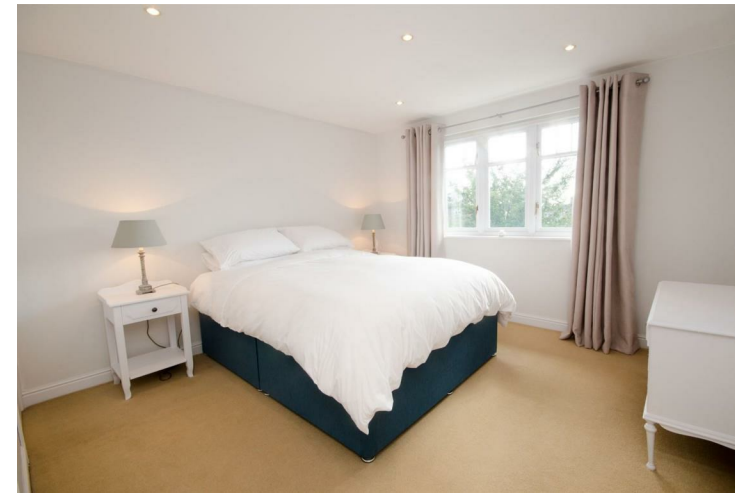
Double glazed window overlooking the garden, recessed ceiling spotlights, double radiator with thermostat, TV aerial point and two built-in wardrobes with hanging space and shelving.