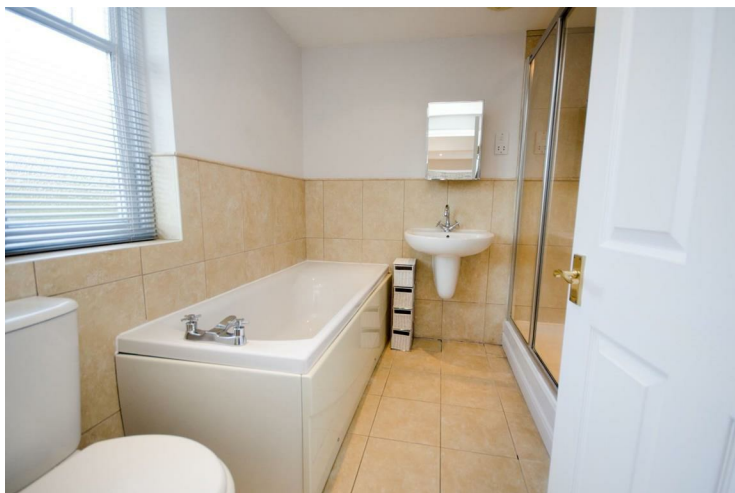
White suite comprising: panelled bath with mixer tap; tiled shower enclosure with mixer shower, glazed shower screen and glazed door; wall-hung wash basin with mixer tap; and low level dual-flush WC. Electric shaver point, recessed ceiling spotlights, tiled floor, ladder style towel radiator, extractor and double glazed window with obscured glass.