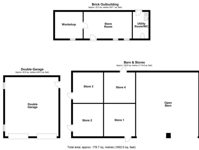
Total area: approx. 176.7 sq. metres (1902.0 sq. feet)