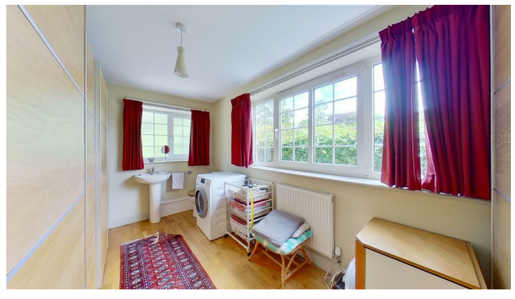
UPVC double glazed window overlooking the front with obscured glass, UPVC double glazed window to side, plumbing for a washing machine. ceiling light point, single radiator with thermostat, engineered oak strip flooring, pedestal wash hand basin, and low level dual-flush WC.