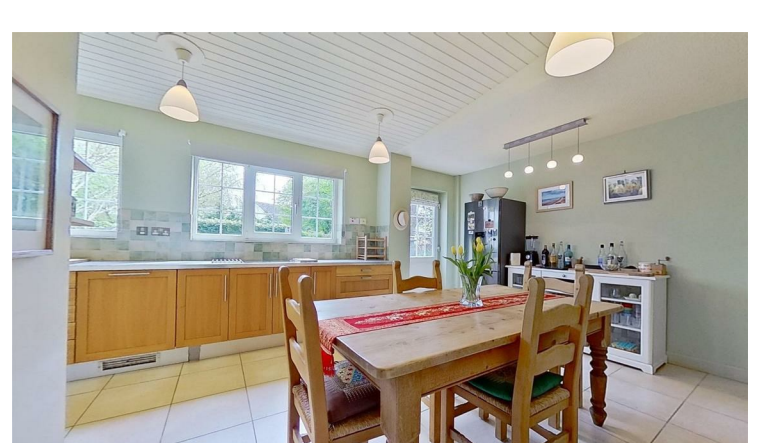
LIVING ROOM 7.90 m x 4.24 m (25"11" x 13"11")