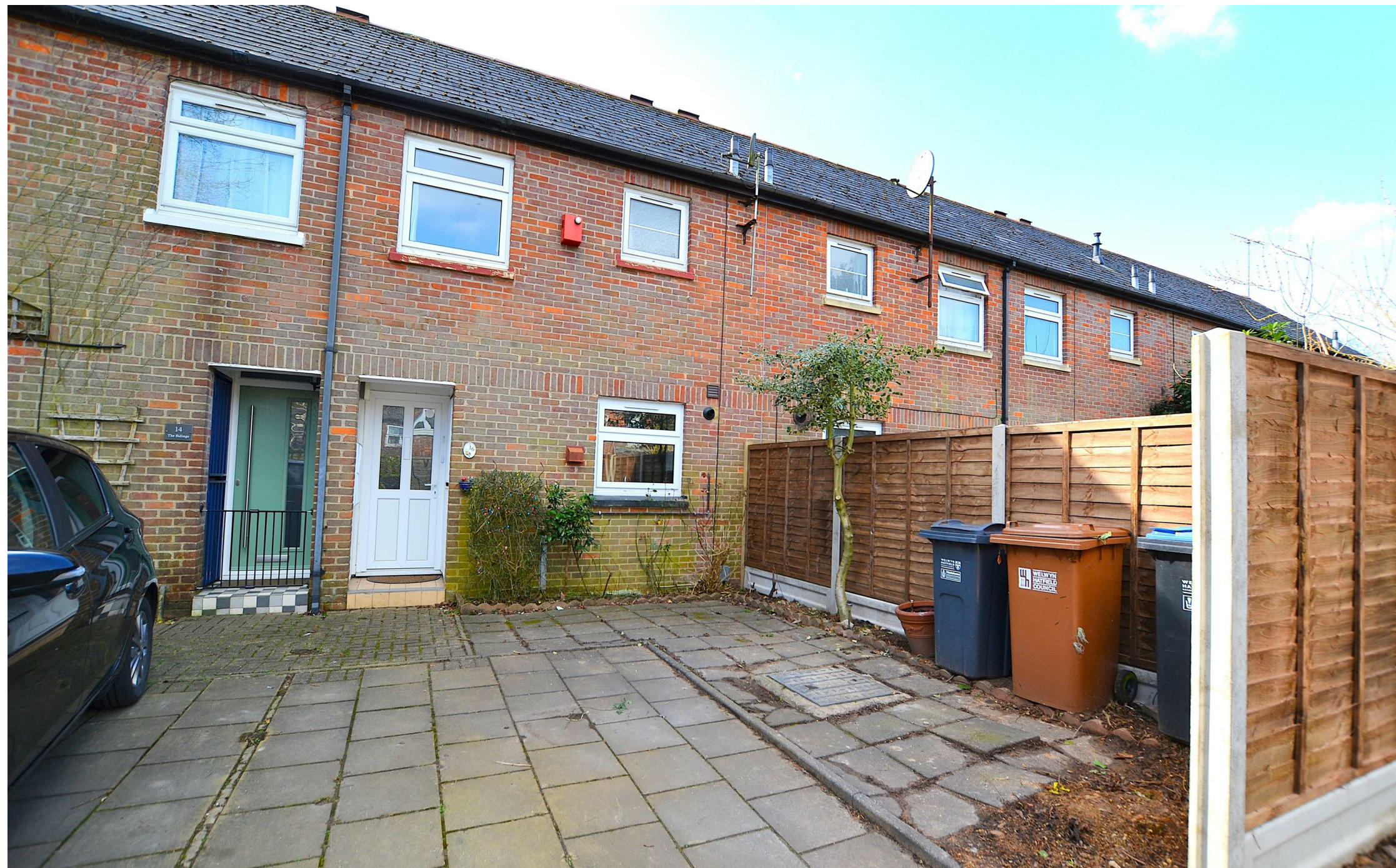
16 The Sidings AL10 9SR Guide Price £350,000