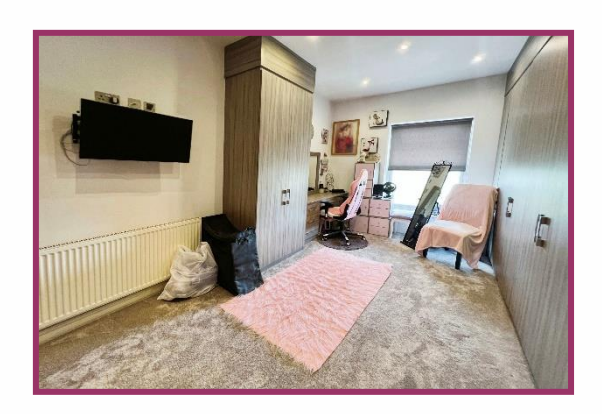
Bedroom 4/office: 8' 5" x 9' 2" (2.56m x 2.79m) uPVC double glazed window rear aspect, fitted wardrobe with overhead storage cupboards and matching drawers, radiator, inset spotlights to the ceiling.