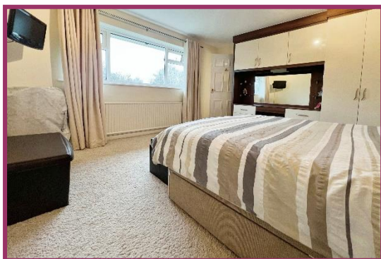
Bedroom 2: 12' 8" x 12' 5" (3.850m x 3.787m) Large uPVC window to the front which enjoys the aspect over the woodland and beyond, quality professionally fitted bedroom furniture, giving a super range of matching: wardrobes, cabinets, dressing table and drawers, display shelving and bridging cabinets.