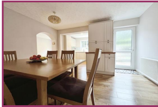
Family room: 13' 3" x 8' 0" (4.027m x 2.445m) Sliding uPVC patio doors onto the rear garden, uPVC window to the side, radiator.