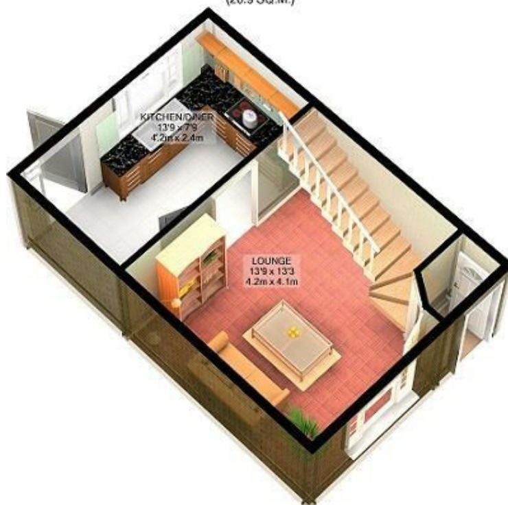
GROUND FLOOR APPROX. FLOOR AREA 289 SQ.FT. (26.9 SQ.M.)