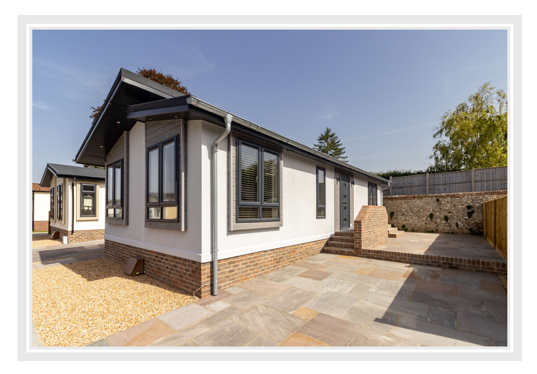
At home in Alresford