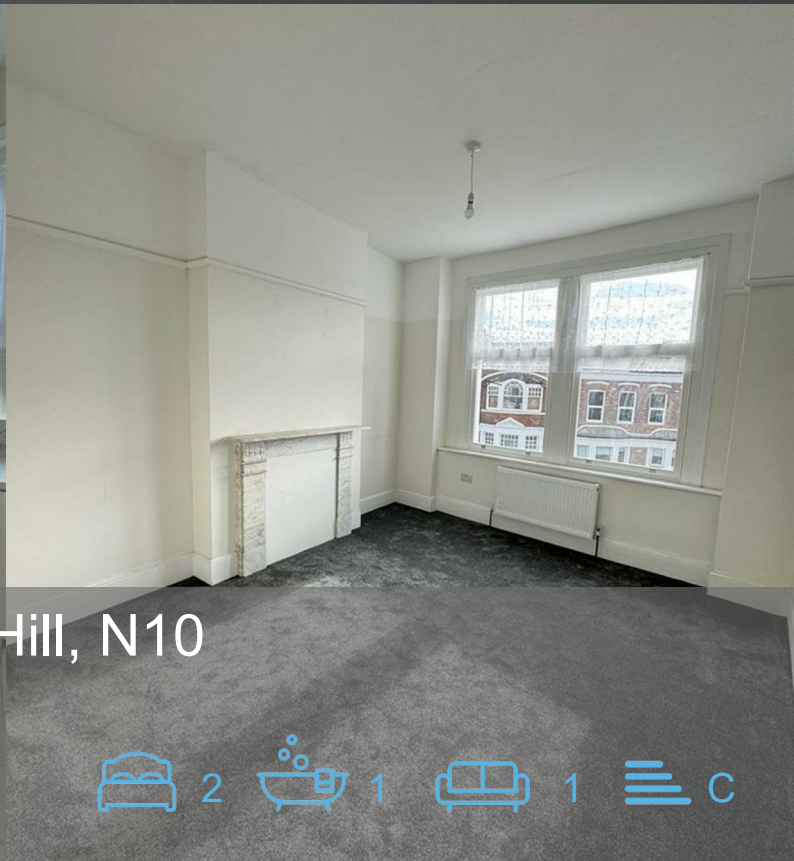
Athenaeum Place, Muswell Hill, N10