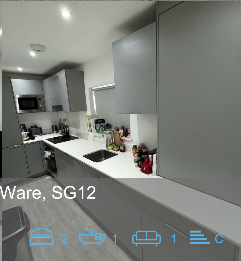
Alpha Cottage, Lloyd Place, Ware, SG12