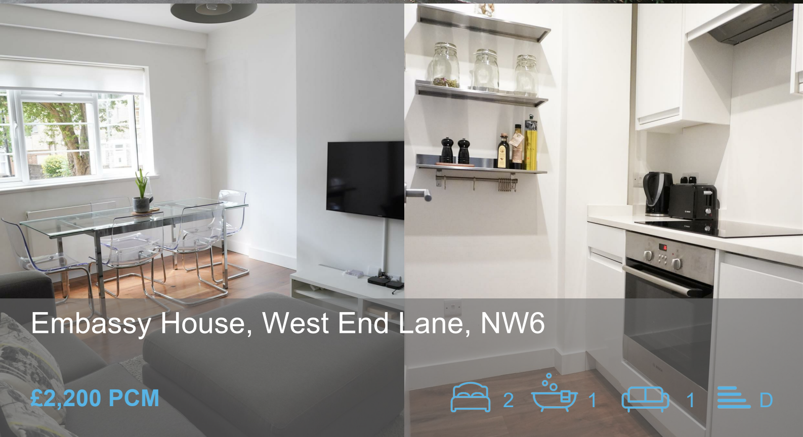
Embassy House, West End Lane, NW6