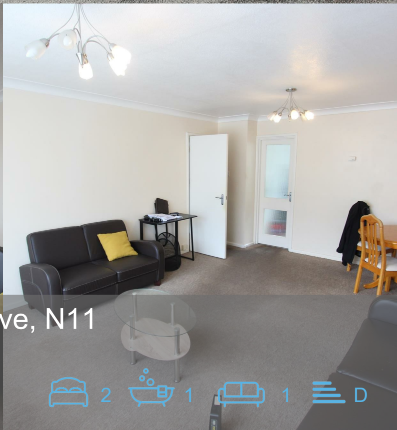
Beaufort Court, The Limes Ave, N11