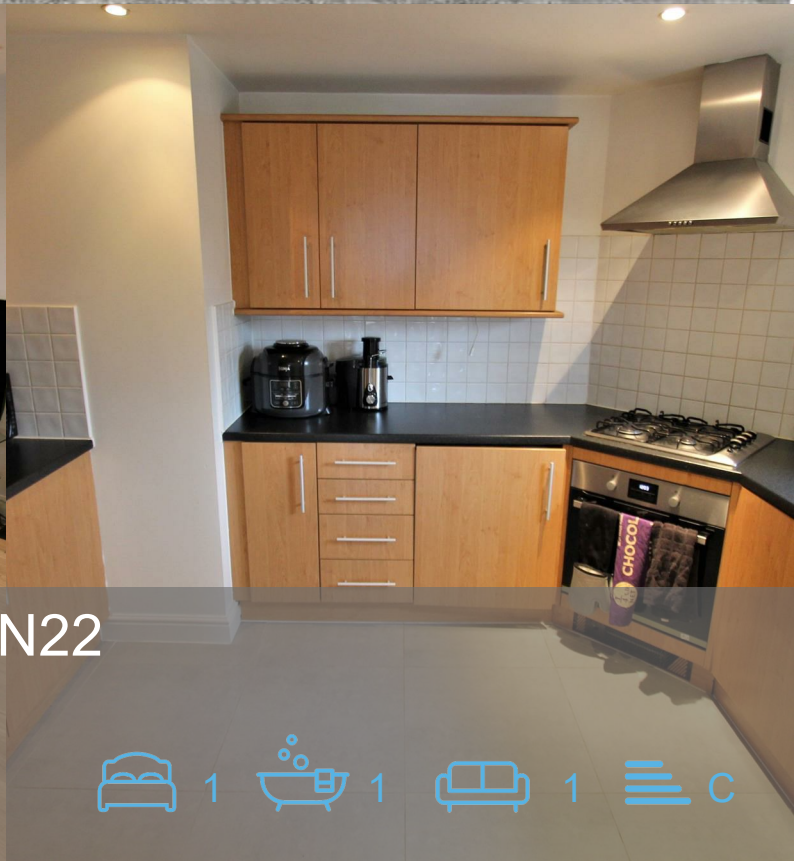
Crown Close, Wood Green, N22