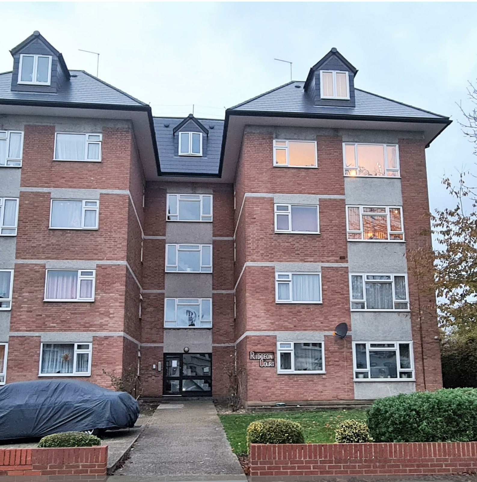
Ridegon Court, Palmerston Road, Wood Green, N22