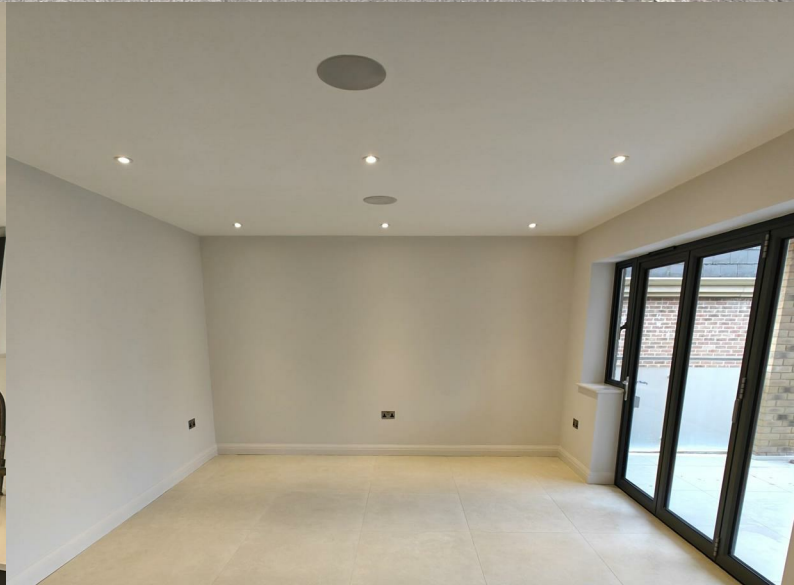
Elysium Court, Waverley Road, Enfield, EN2