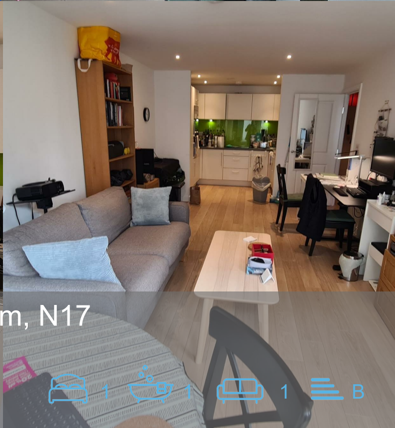
Kingfisher Heights, Tottenham, N17