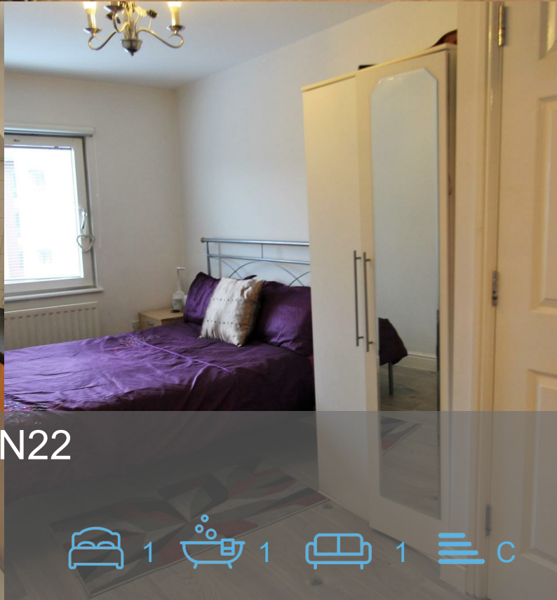
Crown Close, Wood Green, N22