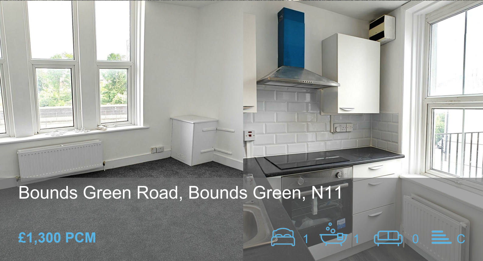
Bounds Green Road, Bounds Green, N11