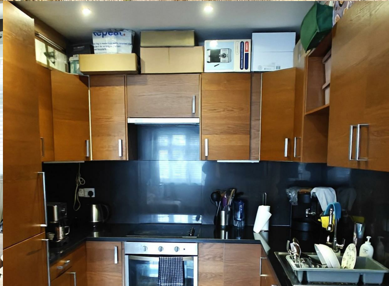
Oakwood Avenue, Southgate, N14