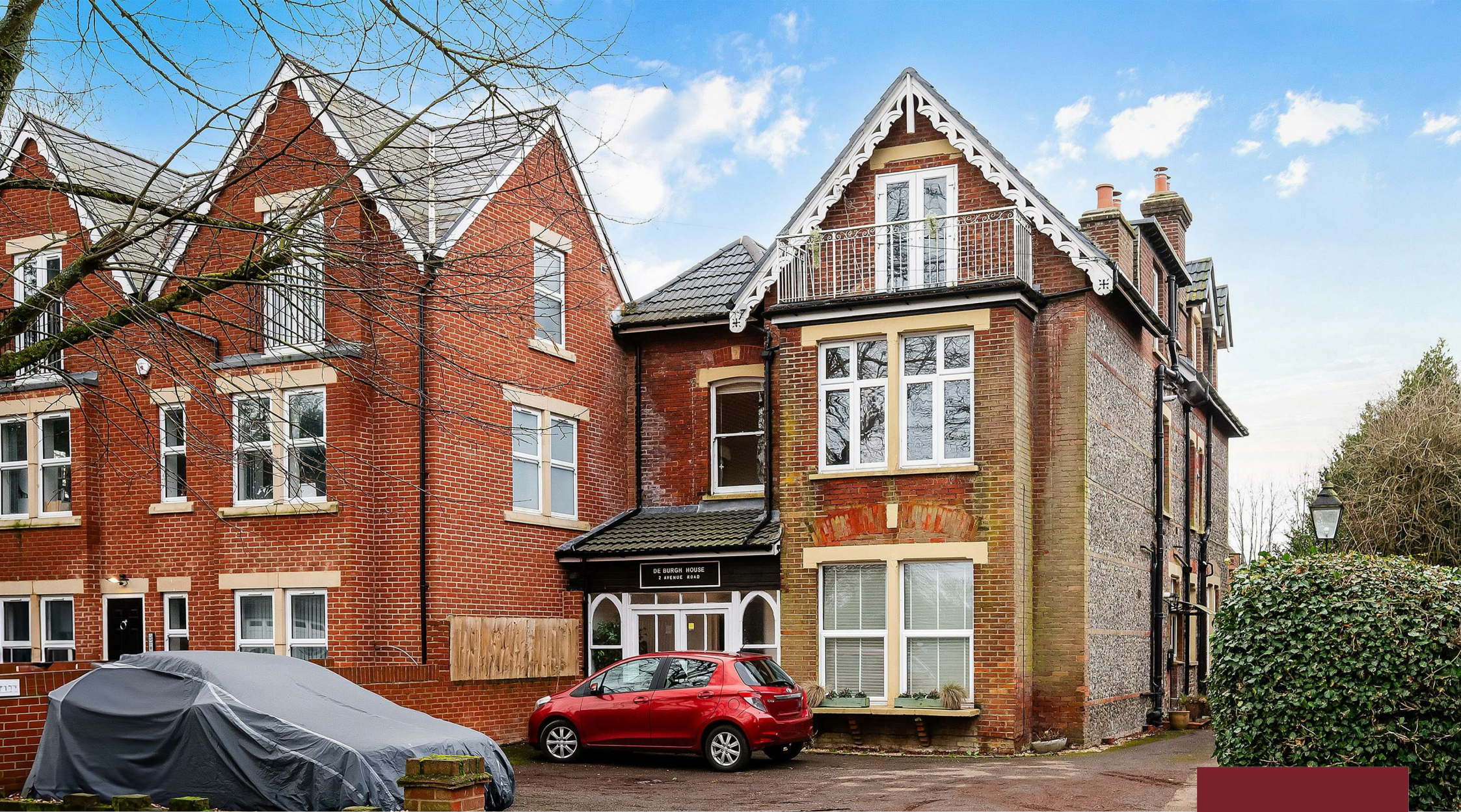
De Burgh House, Banstead, Surrey £650,000 - Leasehold - Share of Freehold