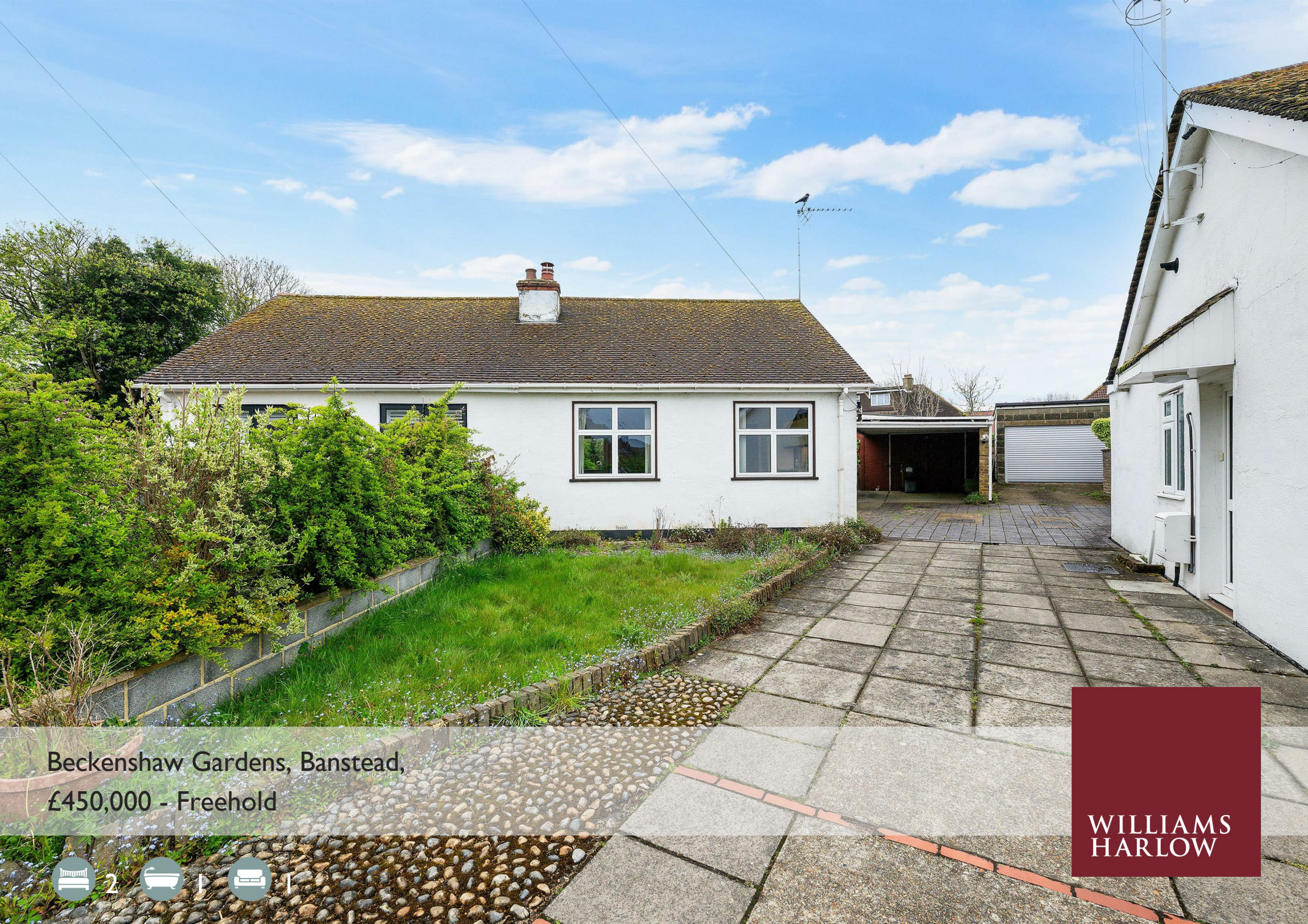
Beckenshaw Gardens, Banstead, £450,000 - Freehold