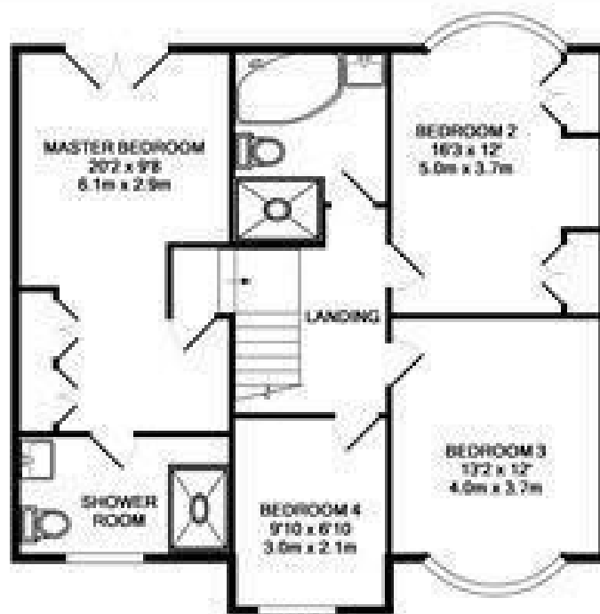
1ST FLOOR APPROX. FLOOR AREA 75.3 SQ.M. (811 SQ.FT.)

TOTAL APPROX. FLOOR AREA 192.0 SQ.M. (2068 SQ.FT.) Measurements are approximate. Not to scale. Illustrative purposes only. Drawn with Metretrac 2000.