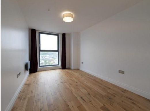
Flat, The Winerack | Key Street | Ipswich | IP4 1FU