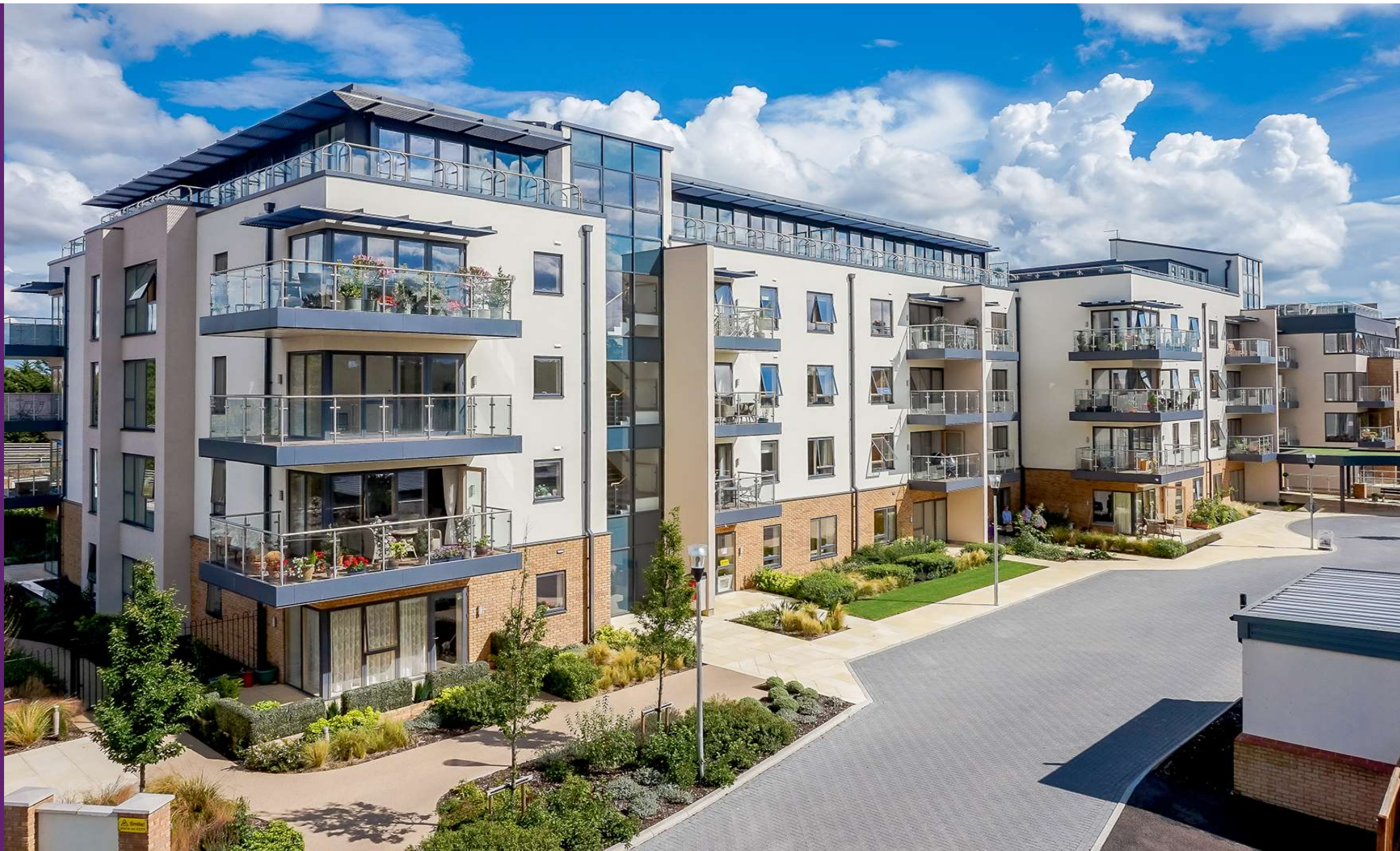
Castle View Retirement Village Helston Lane, SL4