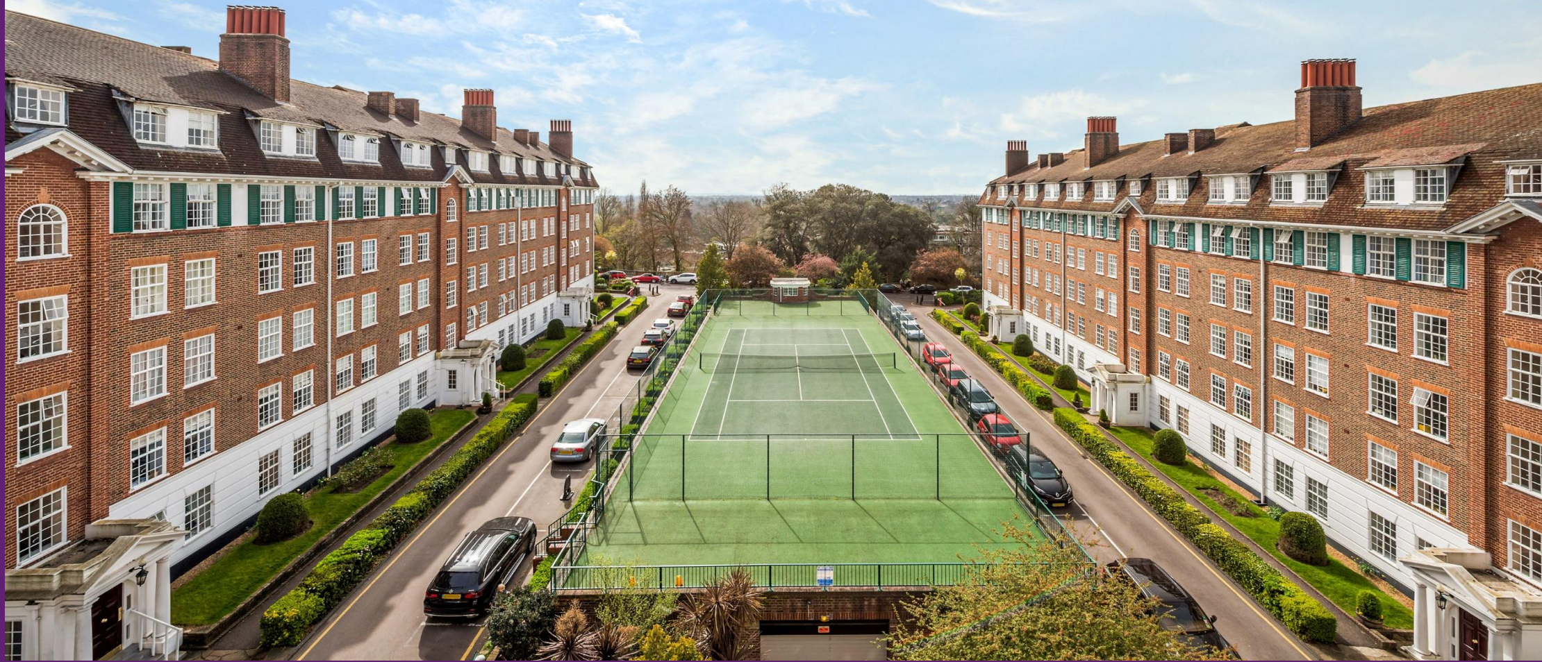
Richmond Hill Court Richmond, TW10