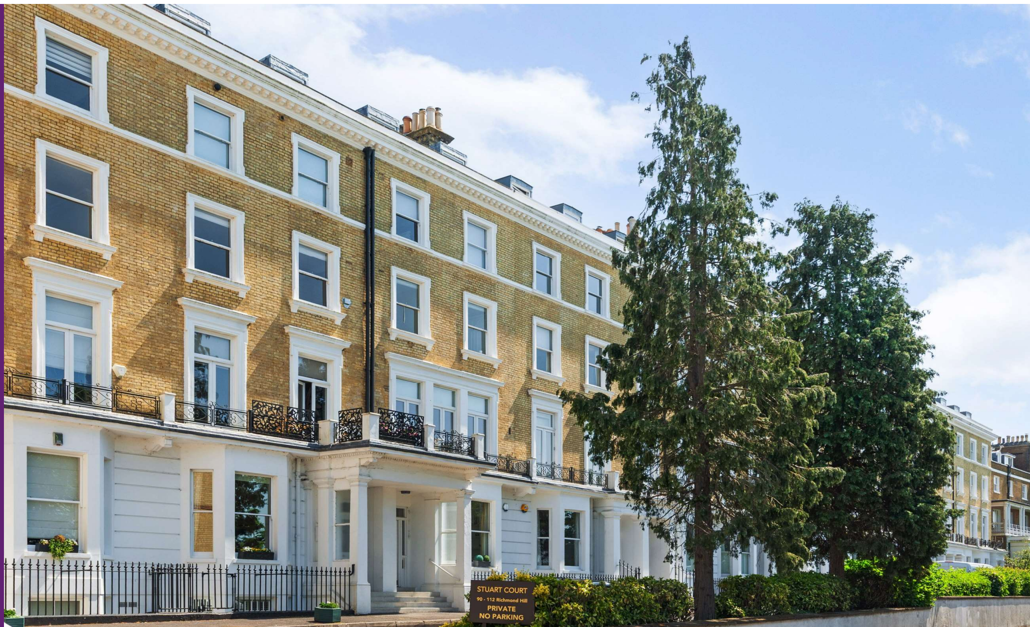
Richmond Hill Richmond, TW10