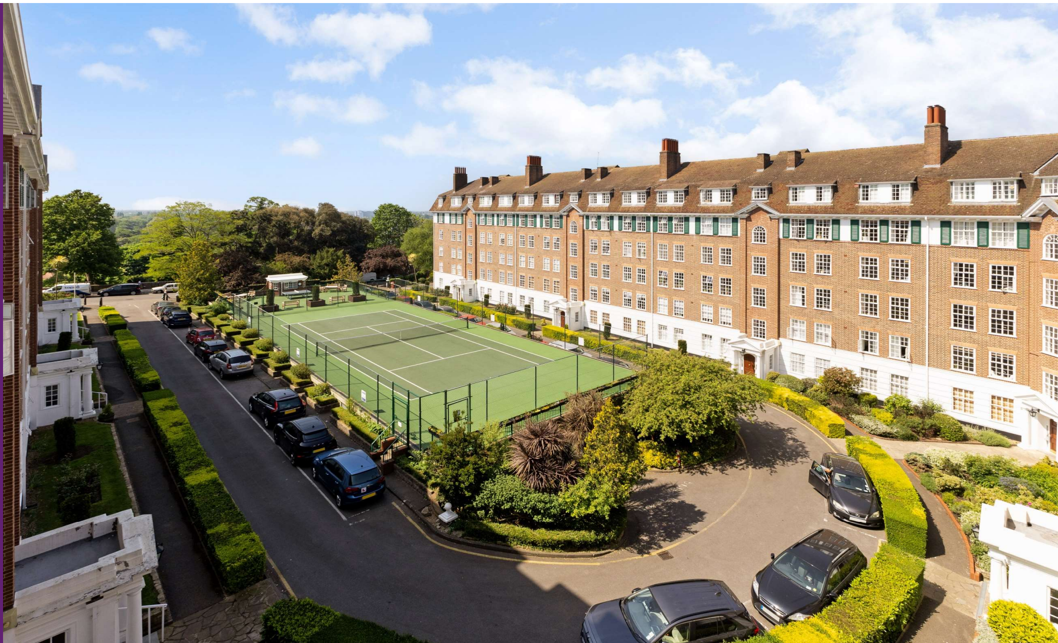
Richmond Hill Court Richmond, TW10