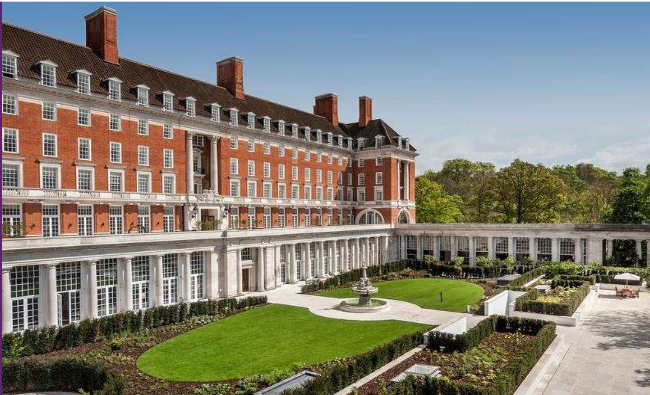
Star & Garter House Richmond Hill, TW10