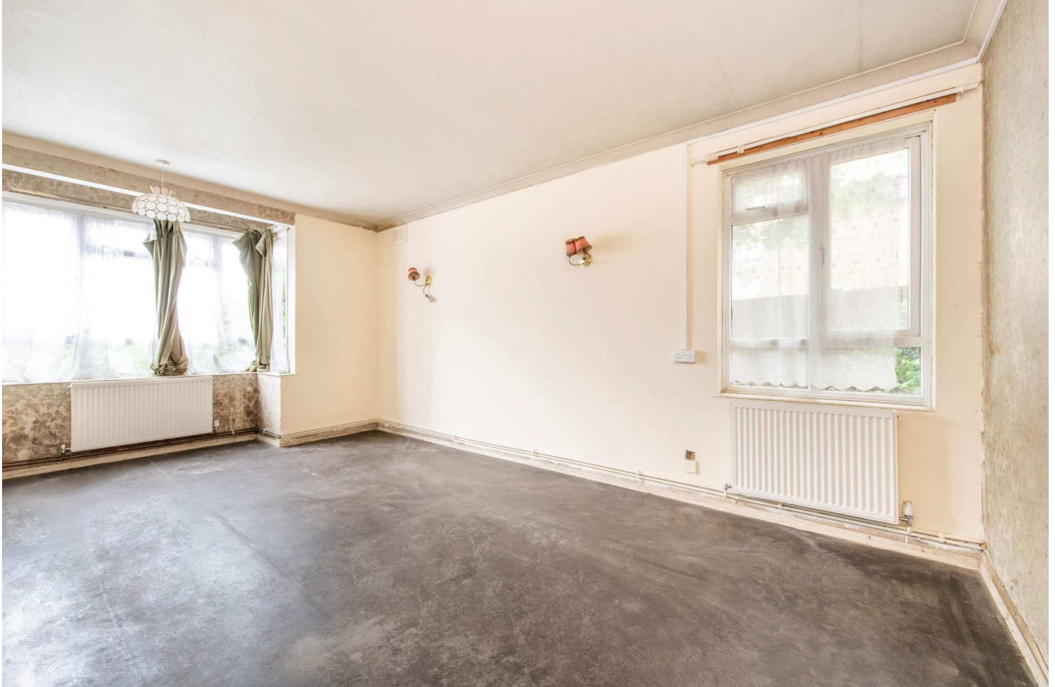
A spacious ground floor three bedroom apartment with no onward chain and garage

Welcome to this spacious 3-bedroom ground-floor apartment located in Walton Court, Sheen Park, Richmond. Offering a generous 1,020 square feet of living space, this property presents a unique opportunity for those looking to create their dream home. The apartment is in need of full renovation, providing a blank canvas for customization to your own taste and style.