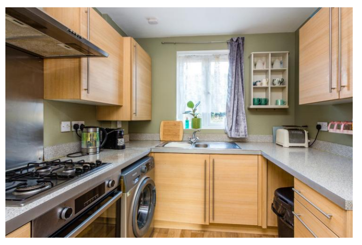
Charlottes Row, Wilson Road, Rushden, NN10 9WG Freehold Price £229,000

Wellingborough Office 27 Sheep Street Wellingborough Northants NN8 1BS 01933 224400