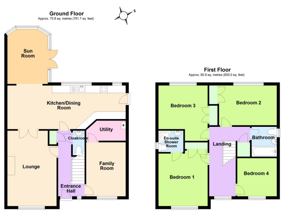
Total area: approx. 131.6 sq. metres (1416.7 sq. feet)