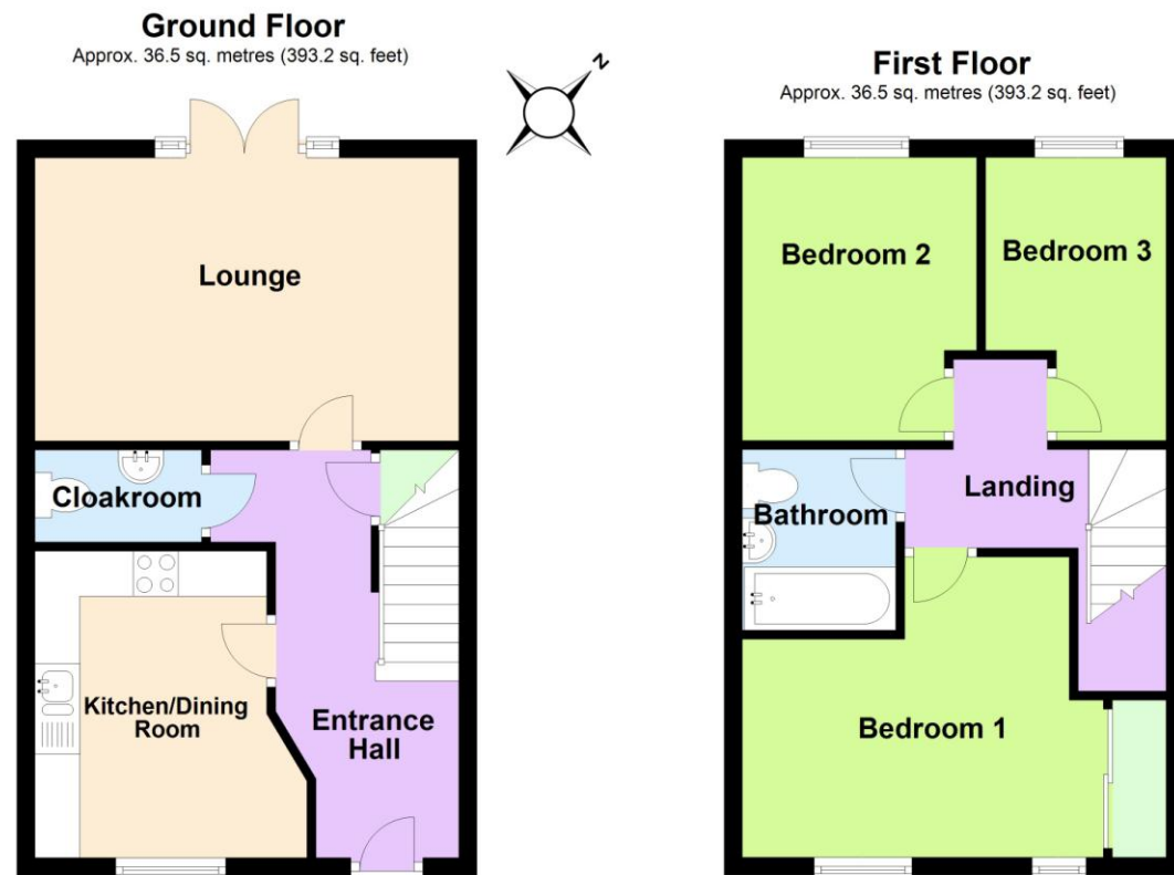
Total area: approx. 73.1 sq. metres (786.5 sq. feet)