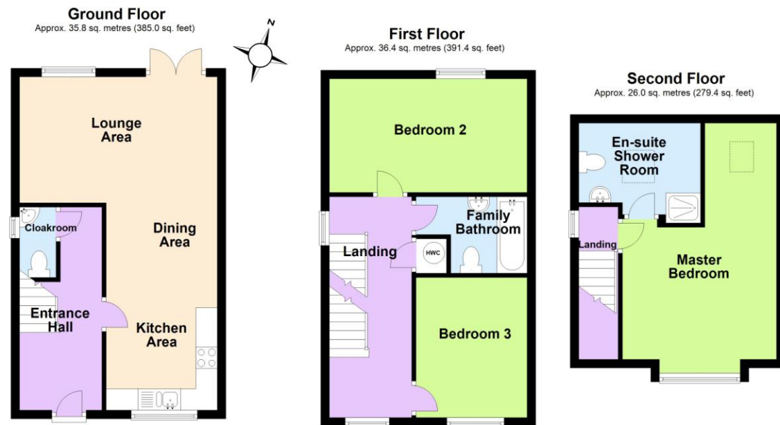
Total area: approx. 98.1 sq. metres (1055.8 sq. feet)