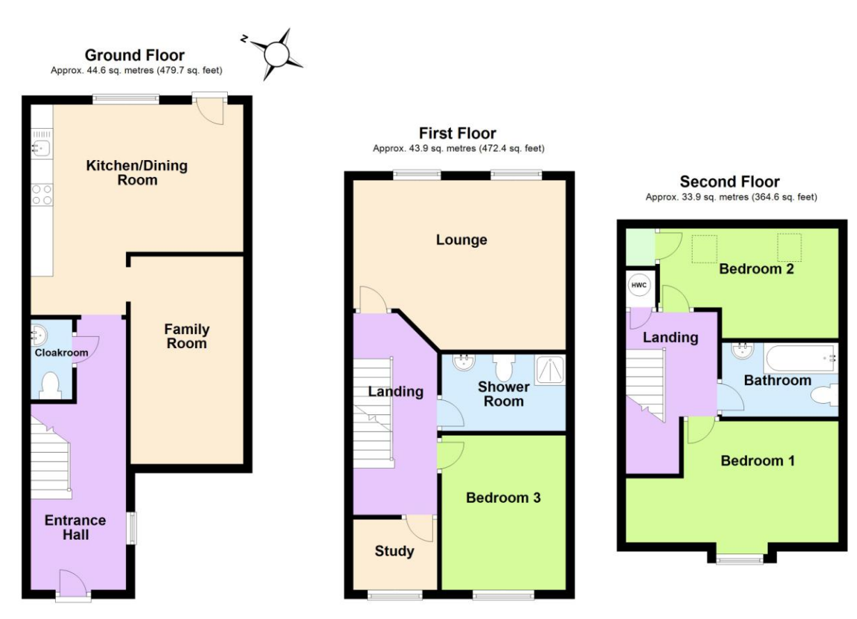
Total area: approx. 122.3 sq. metres (1316.7 sq. feet)