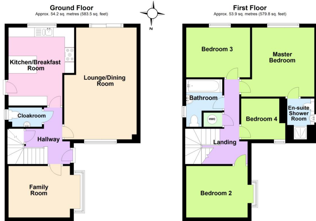
Total area: approx. 108.1 sq. metres (1163.2 sq. feet)