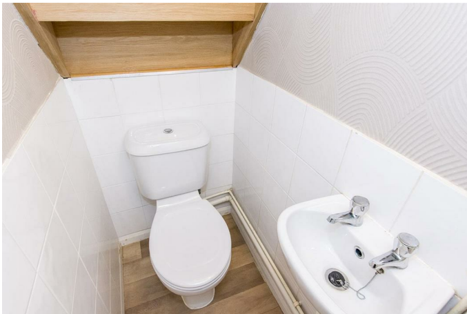
Cloakroom 3'10" x 2'7" (1.17m x 0.79m)

Fitted with a low level WC and a wall hung wash hand basin. Half height ceramic wall tiles and laminate flooring.