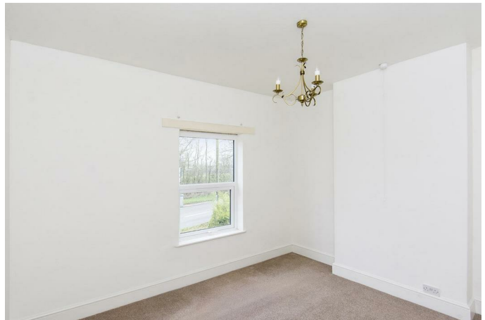
Bedroom One 12'00" x 11'3" (3.66m x 3.43m)

A double bedroom with a window to the front aspect and an electric storage heater.