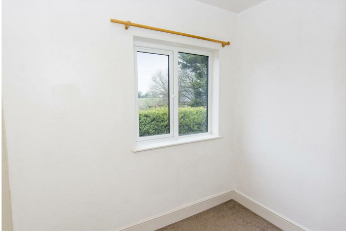
Bedroom Two 8'5" x 6'00" (2.57m x 1.83m)

A single bedroom with a window to the side aspect.