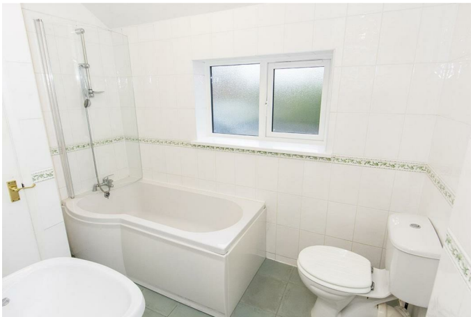
Bathroom 9'00" x 6'00" (2.74m x 1.83m)

Fitted with a low level WC . Pedestal wash hand basin. Bath with shower and side screen. Ceramic wall tiles. Opaque window to the rear aspect. Airing cupboard housing the hot water cylinder.