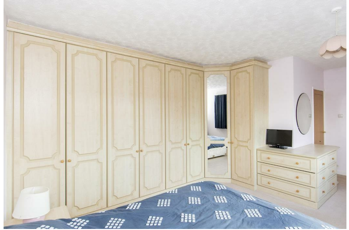
Bedroom Two (Photo Two)