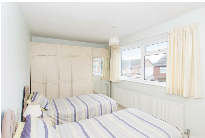
Bedroom Four 15'10" x 9'3" (4.83m x 2.82m)