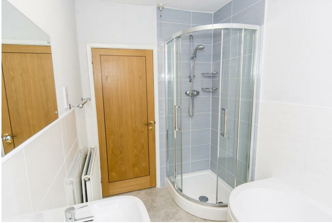
Bathroom (Photo Two)