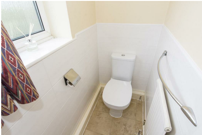
Cloakroom 2'7" x 6' (0.79m x 1.83m)

Fitted with a low-level WC. Hand wash basin set into a vanity unit and a half height ceramic wall tiles. Central heating radiator. Tiled vinyl flooring throughout. Opaque glazed window to the rear aspect.