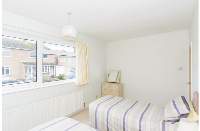
Bedroom Four (Photo Two)