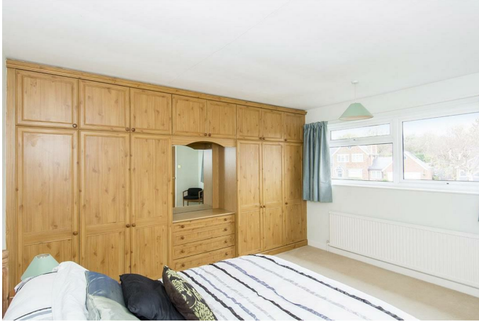
Bedroom One (Photo Two)