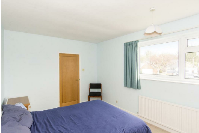
Bedroom Three (Photo two)