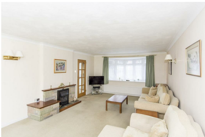
Lounge 26' x 13'4" (7.92m x 4.06m)

The bay fronted lounge is a delightful space, enhanced by a fireplace and patio doors that seamlessly connect the indoors with the outdoor garden, making it an ideal spot for relaxation or entertaining.