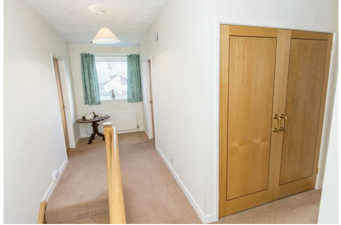
Landing (Photo Two)