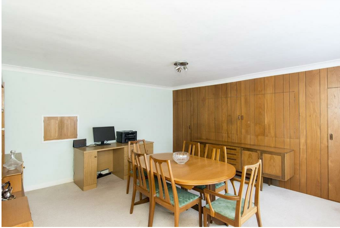
Dining Room (Photo Two)