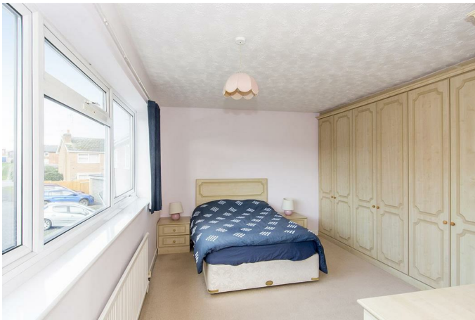
Bedroom Two 19'6" x 11'11" (5.94m x 3.63m)