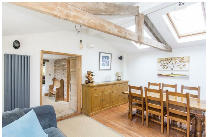
Dining Room (Photo Two)

This spacious dining room is open plan to the kitchen and has a vaulted ceiling with an exposed timber 'A' frame, two Velux skyline windows and a window to the side aspect. Solid oak flooring and two vertical radiators.