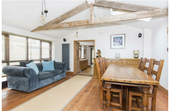
Dining Room 15'8" x 13'1" (4.78m x 3.99m)

This spacious dining room is open plan to the kitchen and has a vaulted ceiling with an exposed timber 'A' frame, two Velux skyline windows and a window to the side aspect. Solid oak flooring and two vertical radiators.