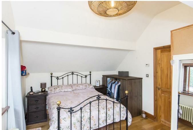
Bedroom Two 14'1" x 10" (4.29m x 3.05m)

A double bedroom with a window to the side and rear aspect. Solid oak flooring and a radiator.