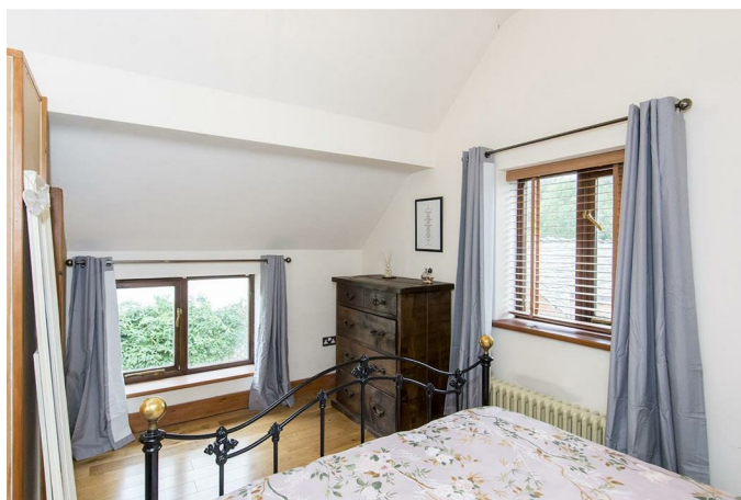
Bedroom Two (Photo Two)

A double bedroom with a window to the side and rear aspect. Solid oak flooring and a radiator.