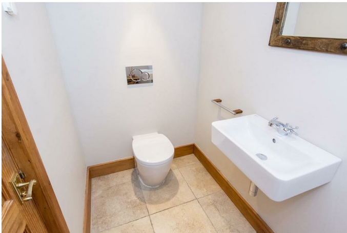
Cloakroom 7' x 4' (2.13m x 1.22m)

Fitted with a low level WC. Wall mounted wash hand basin and ceramic tiled underfloor heating.