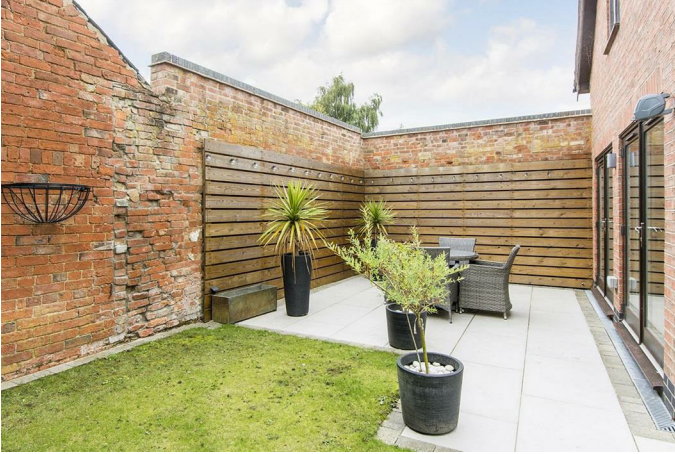
Garden (Photo two)

The property is accessed over a short shared drive. A five bar gate opens into a neat resin driveway which offers ample parking.