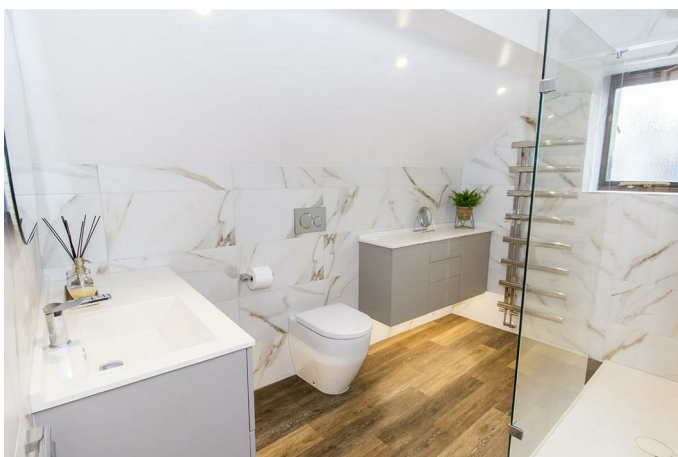
Shower Room 7'1" x 10'2" (2.16m x 3.10m)

Recently re-fitted with modern fitments. Back to wall WC with a hand wash basin set onto a bespoke drawer. There is a further range of fitted cabinets. Under pelmet lighting. A large walk-in shower with glass partition and dual shower heads. Chrome heated towel rail. Striking ceramic wall tiles and luxury vinyl underfloor heating. Opaque window to the front aspect.