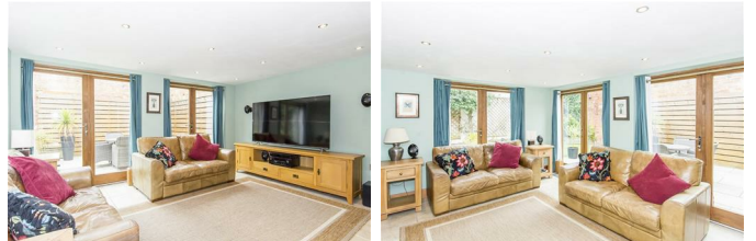
Snug 10'5" x 14'3" (3.18m x 4.34m)

This delightful room is situated at the rear of the property and benefits from having three sets of French doors all opening into the garden. Ceramic tiled underfloor heating.