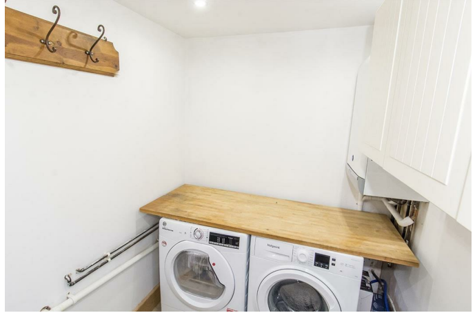
Utility 5'8" x 7'6" (1.73m x 2.29m)

Fitted with cream wall units with space for a washing machine and tumble dryer. Ceramic tiled underfloor heating. The gas central heating boiler is wall mounted. There is ample space to hang all your outdoor coats and boots.