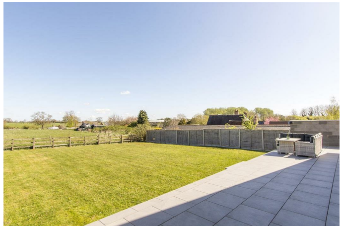
Garden Photo Two

Fitted with a low level WC . Wash hand basin set onto a vanity unit. Chrome heated towel rail. Luxury vinyl flooring.