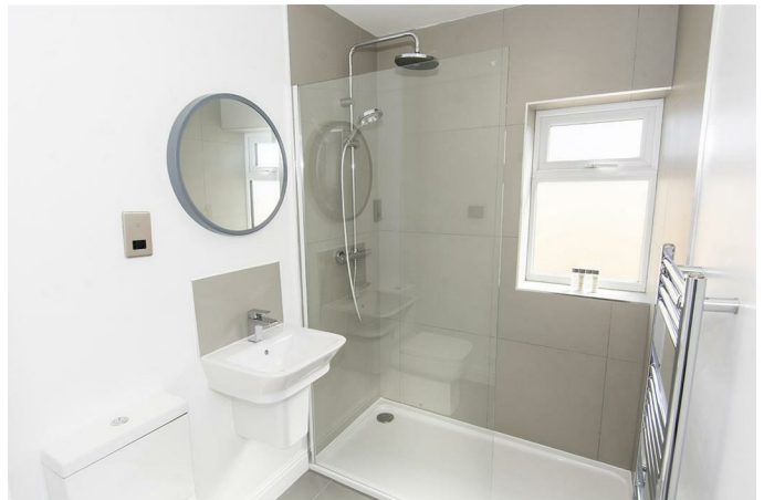
En-Suite 5 x 7 (1.52m x 2.13m)

Fitted with a low level WC. Wall hung wash hand basin. Walk-in shower. Chrome heated towel rail. Ceramic wall tiles. Ceramic tiled flooring. Opaque window.