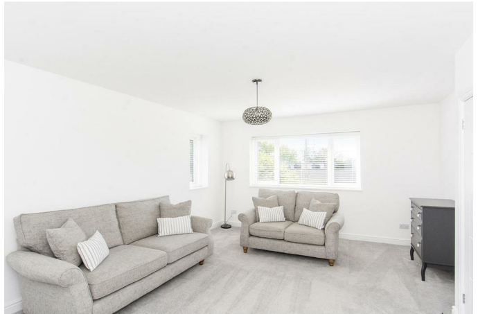
Lounge / Bedroom Four Photo Two