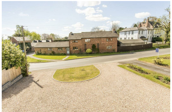
In and Out Gravel Driveway

To the front you will find a sweeping in and out gravel drive that provides ample off road parking and leads to the double garage and entrance to the main house.