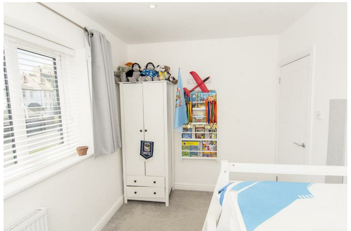
Bedroom Three Photo Two

A double bedroom with a window to the front aspect .