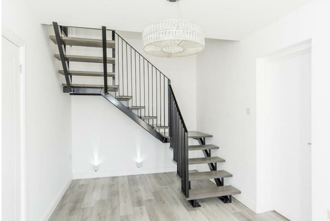
Entrance hall 18'08 x 8'09 (5.69m x 2.67m)

Enter into this spacious hall via a modern composite door where you will find Luxury vinyl flooring and an impressive staircase rising to the first floor. A door gives access to bedroom one and the double garage.