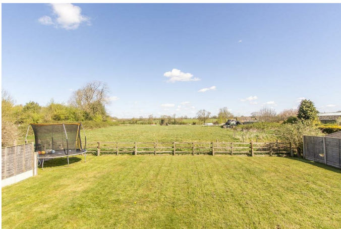
Rural Views Photo

To the front you will find a sweeping in and out gravel drive that provides ample off road parking and leads to the double garage and entrance to the main house.