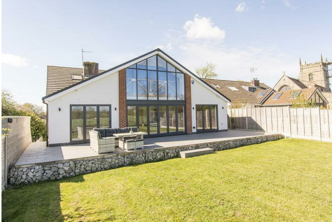
Rear Aspect Photo