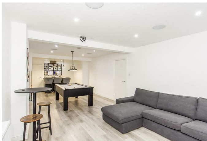
Games Room Photo Two

This fabulous entraining space is set up as a games and family room . The bar area is has ample seating and is fitted with modern cabinets with quartz surfaces .A circular sink , integrated dishwasher and a drinks cooling fridge. Luxury vinyl flooring and three radiators. A door gives access through to the double garage.