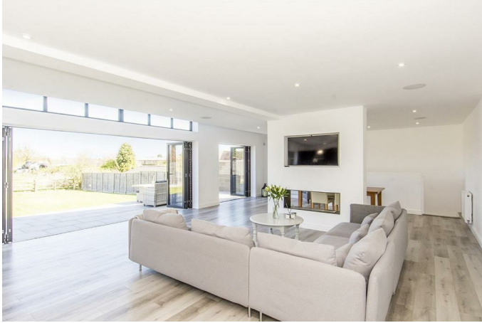
Living Area Photo