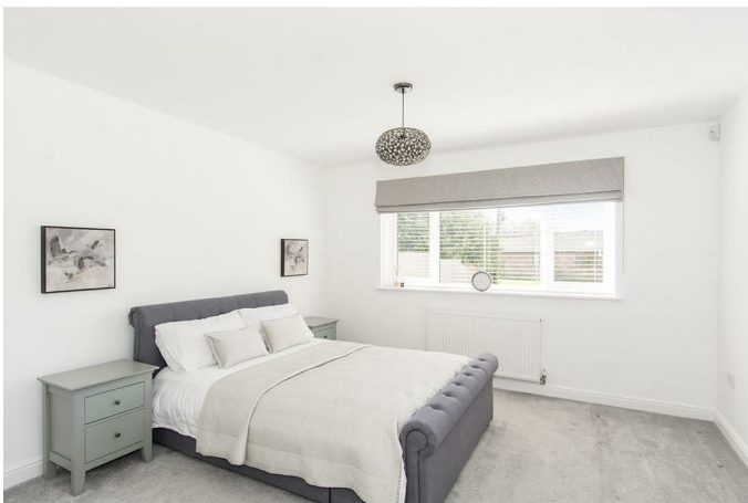
Bedroom One 13'2 x 12'5 (4.01m x 3.78m)

A double bedroom has a window to the front aspect and opens into a dressing area.