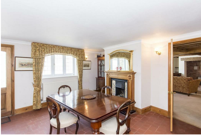
Dining Room 16'5" x 14'11" max (5.00m x 4.55m max)

Accessed via timber front door with opaque double glazed panels. Leaded double glazed window to the front elevation. Period cast iron open fireplace with period hand painted cheeks and timber surround. Stairs rising to the first floor. Four wall lights. Quarry tiled flooring. Radiator. Stripped timber door to:-