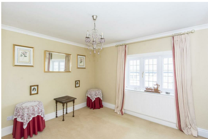
Bedroom Three 14'9" x 9'10" (4.50m x 3.00m)

Leaded double glazed window to the front elevation. Radiator.