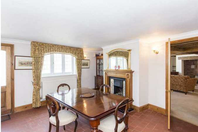
Dining Room 16'5" x 14'11" max (5.00m x 4.55m max)

Accessed via timber front door with opaque double glazed panels. Leaded double glazed window to the front elevation. Period cast iron open fireplace with period hand painted cheeks and timber surround. Stairs rising to the first floor. Four wall lights. Quarry tiled flooring. Radiator. Stripped timber door to:-