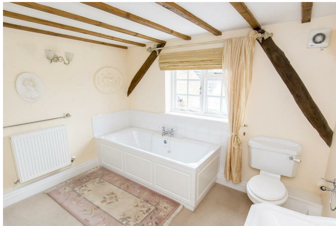
Bathroom 10'1" x 7'0" (3.07m x 2.13m)

Panelled bath. Pedestal wash hand basin. Low level WC. Complementary tiling. Exposed A frame beams. Two doors to walk in airing cupboard housing lagged hot water tank and gas fired central heating boiler. Two wall lights. Extractor fan. Double glazed window to the rear.