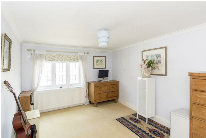
Bedroom Two 11'5" x 11'7" (3.48m x 3.53m)

Leaded double glazed window to the front elevation. Fitted wardrobes. Radiator. Access to loft space.