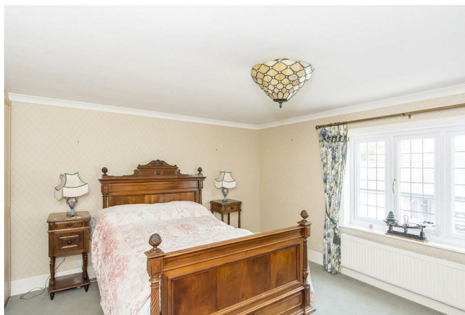
Bedroom One 15'2" x 11'7" (4.62m x 3.53m)

Leaded double glazed window to the front elevation. Spacious built in wardrobes. Radiator.