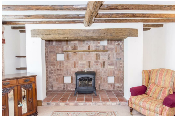
Lounge (Photo 2)

Two leaded double glazed windows to the front elevation. Inglenook style fireplace with heavy timber beam and exposed brick and hearth. Beamed ceiling. Two radiators. Television point. Oak door to:-