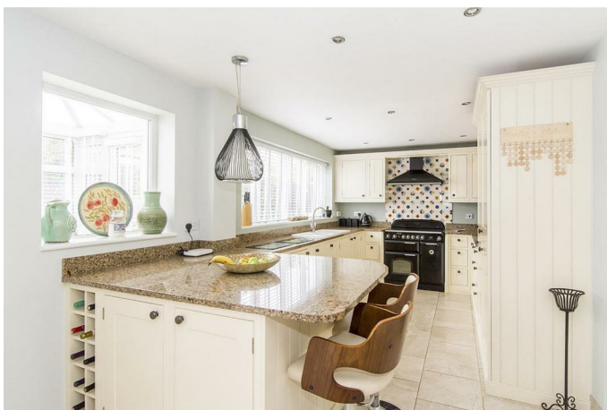
Kitchen/ Dining Room 27'5"max x 12' max (8.36mmax x 3.66m max)

With dual zoned under-floor heating this spacious dining kitchen is the heart of the home and is fitted with a wide range of modern cream cabinets with complimenting granite surfaces. Porcelain bowl and half sink with mixer taps. Rangemaster Electric oven with extractor canopy over. Integrated fridge -freezer and dishwasher. Breakfast bar seating area with granite surface. The dining room is open-plan to the kitchen and is the ideal space to entertain friends and family. Dual rear aspect windows and a door opens into the conservatory.