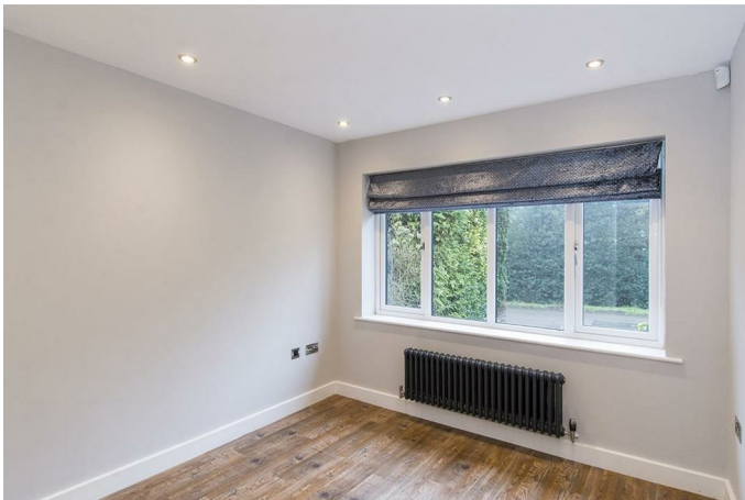
Family Room 10'3" x 9'2" (3.12m x 2.79m)

This flexible room has a window to the front aspect, a modern grey column radiator, Amtico flooring and a storage cupboard.