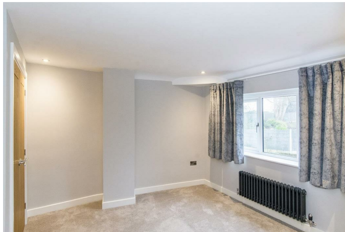
Bedroom Three 11'5" x 9'8" (3.48m x 2.95m)

A double bedroom with a window overlooking the garden, grey column radiator and built in wardrobes.