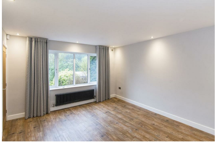
Lounge 15'7" x 12' (4.75m x 3.66m)

This spacious lounge has a window to the fronts aspect, a modern grey column radiator, Amtico flooring and a power socket for a wall mounted TV.