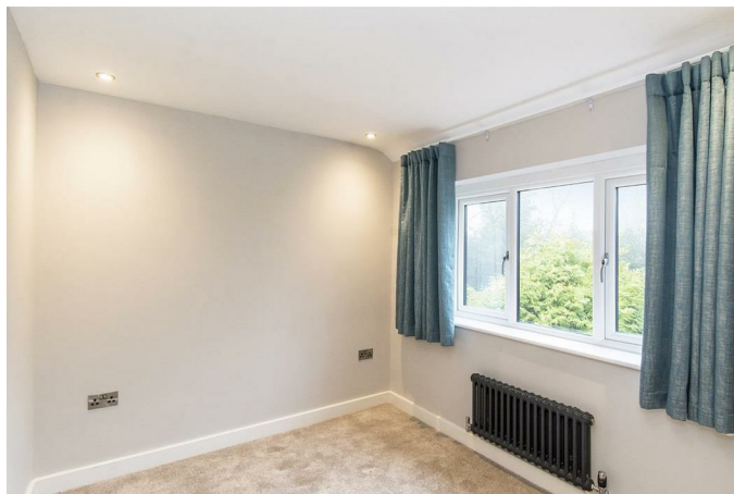
Bedroom Four 9'3" x 7'10" (2.82m x 2.39m)

A double bedroom with a window to the front aspect and a grey column radiator.