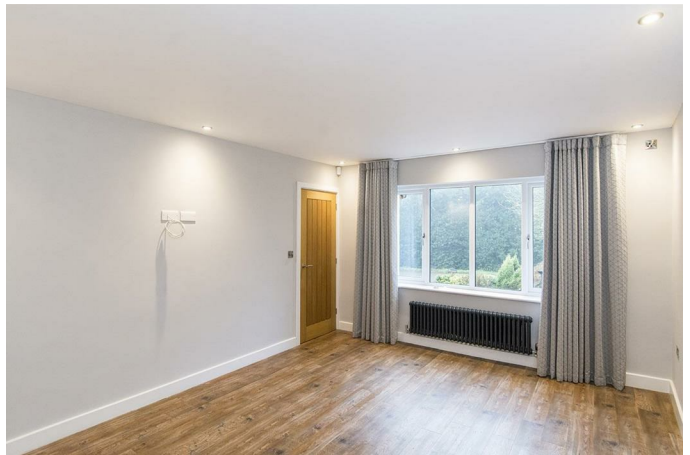
Lounge Photo Two

This spacious lounge has a window to the fronts aspect, a modern grey column radiator, Amtico flooring and a power socket for a wall mounted TV.