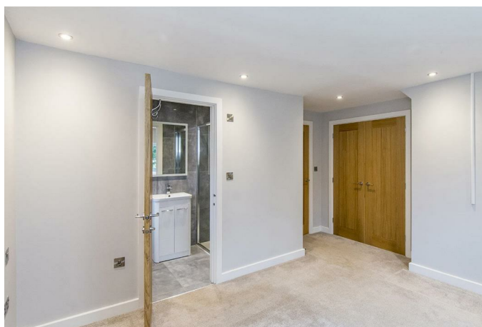
Principal Bedroom Photo Two

A double bedroom with a window overlooking the garden, column grey radiator and built-in wardrobes. A door opens into the en-suite.