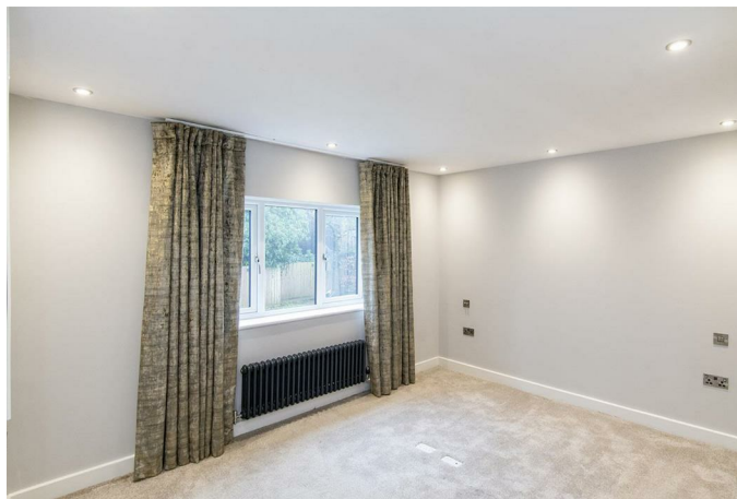
Principal Bedroom 12' x 9'7" (3.66m x 2.92m)

A double bedroom with a window overlooking the garden, column grey radiator and built-in wardrobes. A door opens into the en-suite.