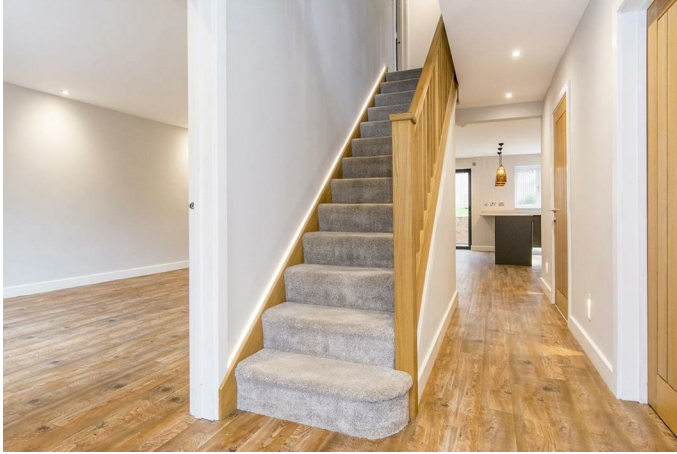
Entrance Hall 6' x 19'11" (1.83m x 6.07m)

Enter into this warm and welcoming hall via a modern composite door where you will find a column grey radiator, Amtico flooring and the oak staircase rises to the first floor.