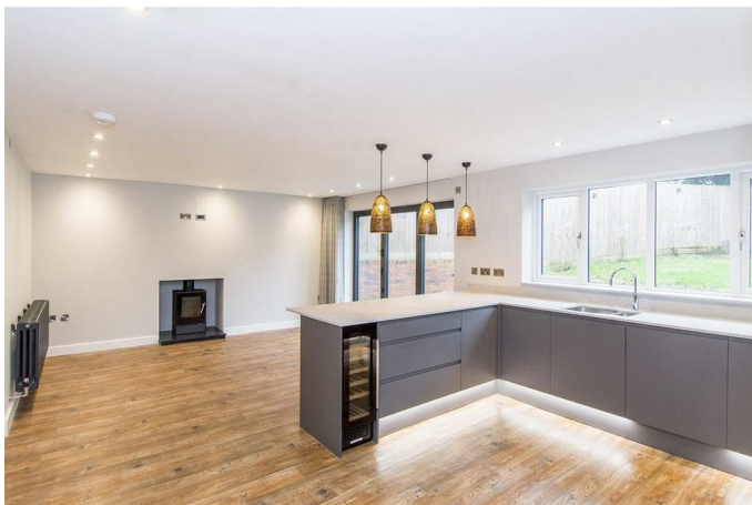
Living Dining kitchen 23'10" x 13'9" (7.26m x 4.19m)

The kitchen is fitted with a wide range of modern grey cabinets with quartz surfaces. Stainless steel undermounted bowl and half sink unit with mixer taps. Neff appliances include a double oven with warming drawer, Induction hob with extractor, canopy, integrated dishwasher & fridge-freezer and wine cooling fridge. There is a window to the rear aspect and a door opening to the side. The breakfast bar has attractive lighting above. The dining area has a wood burning stove and a set of bi-folding doors that open onto the patio.