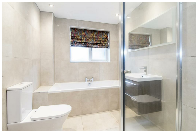
Bathroom 9'2" x 6'8" (2.79m x 2.03m)

Fitted with a low level WC, wash hand basin set onto a bespoke drawer unit, shower cubicle with sliding doors, bath with central taps, chrome heated towel rail, ceramic wall and floor tiles, opaque window to the side aspect.