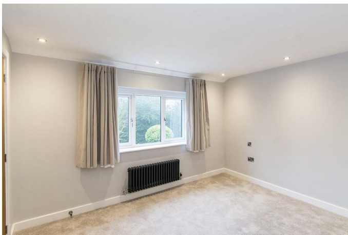
Bedroom Two 12'3" x 11'7" (3.73m x 3.53m)

A double bedroom with a window to the front aspect, grey column radiator and built in wardrobes.